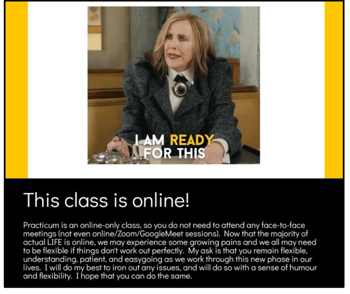
Figure 3: Screenshot of Sharon Lauricella's Syllabus

Sharon demonstrates a playful attitude before her students even show up to an online class, walk in the classroom door, or engage with the course via the university's learning management system (LMS). Her syllabi indicate playfulness in that each syllabus includes a contemporary popular culture theme where she uses memes, quotes, or images to illustrate points in the syllabus (see Figure 3). In the winter of 2021, for example, she used a graphic design program to create syllabi featuring images and quotes from Schitt's Creek (this television show is particularly relevant in that it is Canadian and was filmed just a few miles from campus). In the section about online course delivery, the syllabus features an image of Catherine O'Hara as Moira Rose exclaiming, "I am ready for this!" thus indicating both faculty and student readiness for online learning. This playful addition of images and unconventional quips sets her syllabi apart from others.