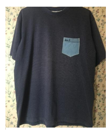
Figure 3: Denim Pocket Tee