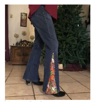
Figure 1: Flared Jeans

Our team also reached out to the upcycling artists who made each of the samples that we used in our personal interviews. We wanted to ask the sellers about the time and costs necessary to produce each product we purchased from them. Our initial message simply let the seller know that their item was purchased to support an honors business thesis project at The University of Akron and that we would appreciate any estimates they could share with us to understand the upcycling business on a deeper level.