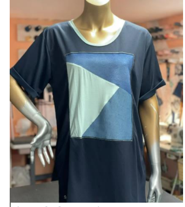
Figure 2: Geometric Tee