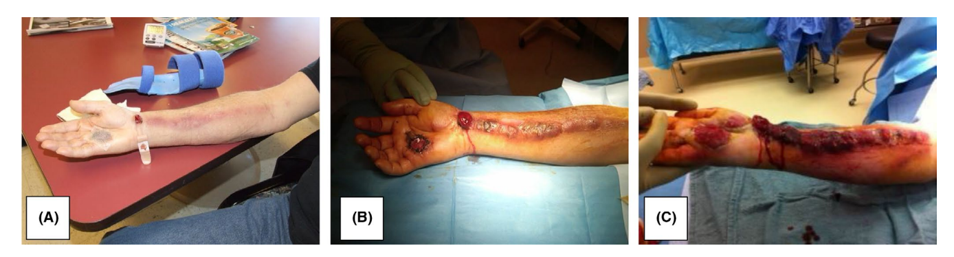
FIGURE 3 Ascending malignancy: A, 8 days postexcisional biopsy with proximal erythema and new mass; B, intraoperative view: subsequent incisional biopsy; C, intraoperative photograph of ELD from receiving tertiary care center

further procedures pending pathological analysis, thus avoiding flap morbidity.