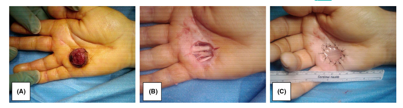
FIGURE 2 A, Preoperative mass; B, intraoperative view with mass excised; C, postoperative closure with Integra