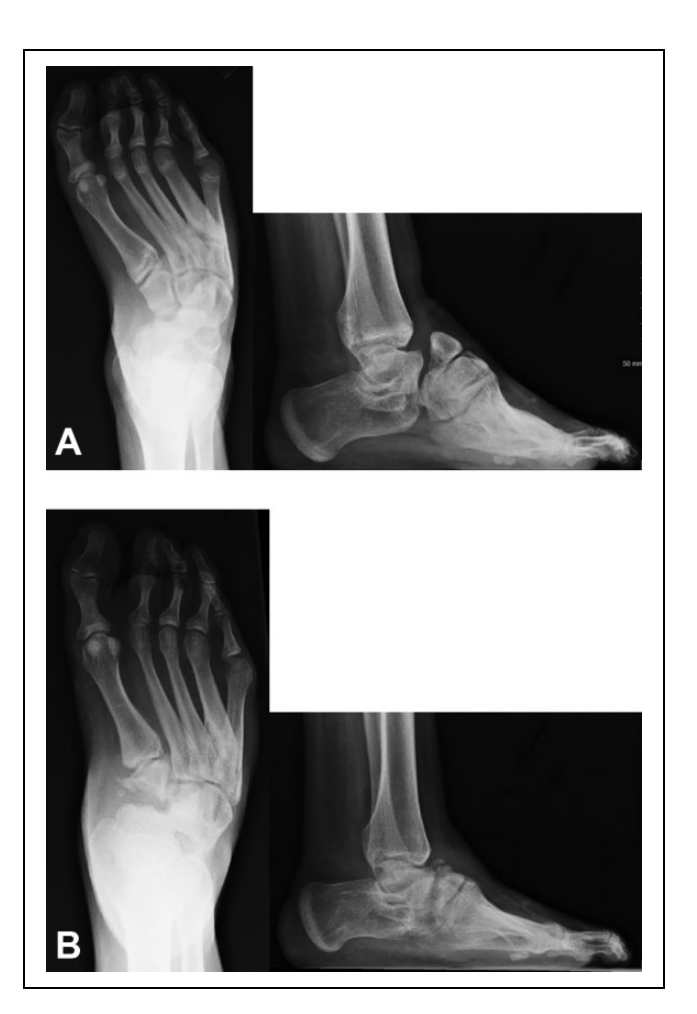
Figure 1. (A) Preoperative AP and lateral radiographs of a 14.9-year-old male (Table 2, case 3) with residual talipes equinovarus deformity after previous soft tissue release during early childhood. Naviculectomy with talocalcaneal and CC fusion of the right foot is performed. (B) AP and lateral radiographs 1.2 years after naviculectomy. Despite lack of fusion between the talus and cuneiforms, the patient had no complaints of continued pain and require no additional surgery. AP, anteroposterior.

Fusion of the talus to the cuneiforms occurred in 7 of 13 feet after naviculectomy. Two of these patients required additional medial column procedures (midfoot osteotomy in 1 patient and talocuneiform arthrodesis in 1) during