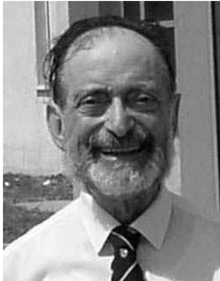
Figure 4: Frank Harary.