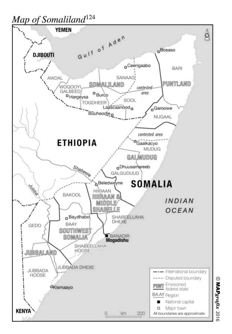
Background: Somaliland's experience with transitional justice

The Somali people are considered to be a largely homogenous ethnic group that reside in the Horn of Africa and are dispersed throughout many eastern African countries including Ethiopia, Kenya, and Djibouti with the majority living in Somalia and Somaliland. A large proportion (but not all) of Somali people are characterized by an abiding belief in Islam and its tenets as well as taking pride in their lineages ( abtiiris ). The agnastic grouping of Somalis into clans based on common ancestry is a system that has been borrowed from Islam and Arabia.