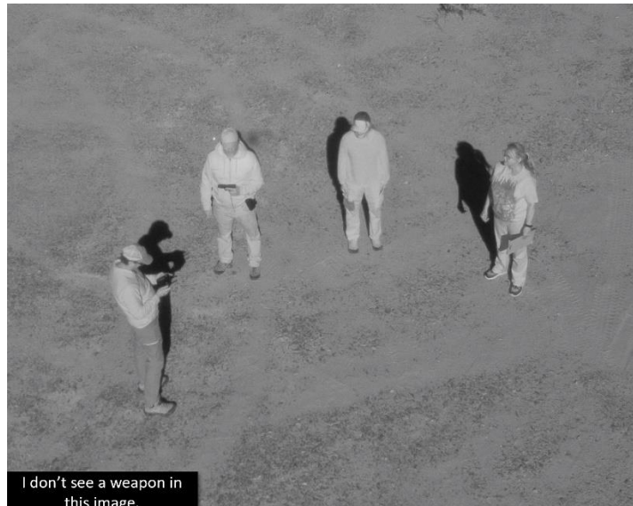
Image Screenshot of NIR Image of an Active Threat Holding a Pistol from a Slant Range of 25 Feet