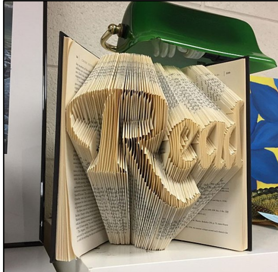
Upper: (Handaculture, 2015, CC BY-SA 4.0)