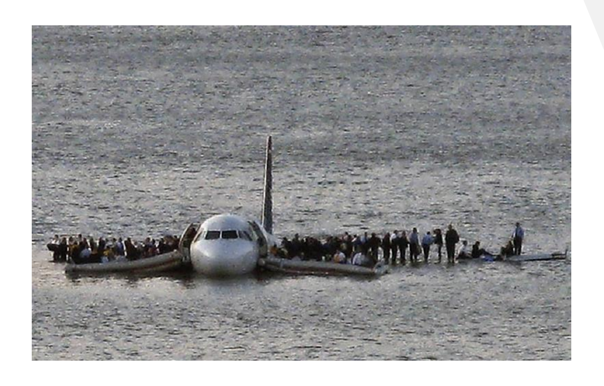
US Airways Flight 1549