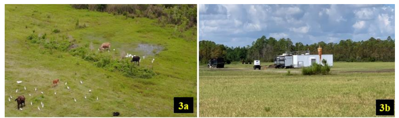
Figure 3. Images of Cattle Egrets the Data Collection Area

Note. Figure 3a shows 34 Cattle Egrets foraging close to cattle. Figure 3b show man-made and other structures between the trailer and the location where we observed Cattle Egrets with the drone.