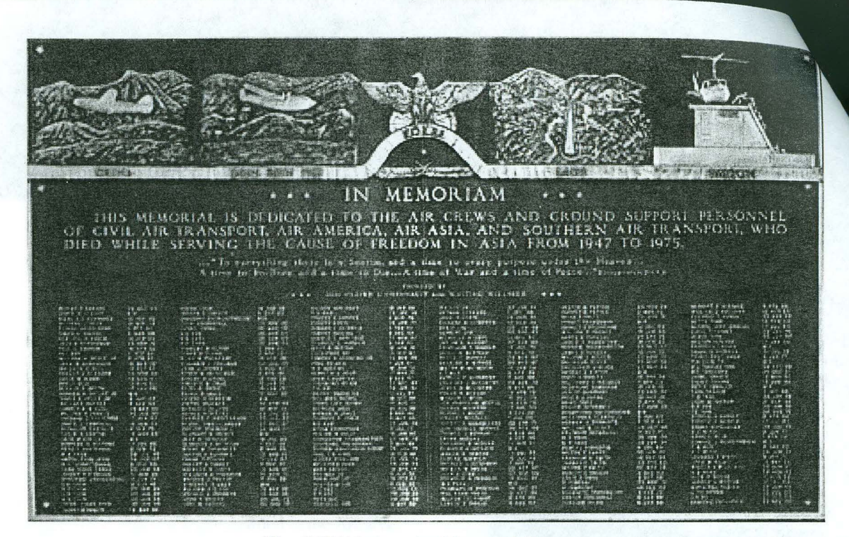
The CAT/Air America Memorial Plaque

With the spread of communism throughout Southeast Asia, CAT's mission changed. In 1959 CAT was renamed Air America. Under the new corporate name, (though CAT continued to fly scheduled passenger flights out of Taiwan), Air America flew all other type of air operations in Laos and South Vietnam. Operating in mountainous terrain, Air America crews flew with skill and courage in supplying the anti-communist forces