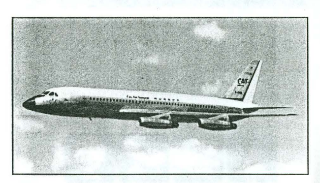
CAT Convair 880 Mandarin Jet

Memorial Plaque. The CAT/Air America Memorial Plaque was designed and paid for by funds from the memberships of both the CAT Association and the Air America Association. In 1987, the CAT and Air America Memorial Plaque was dedicated during a solemn service. The plaque stands as a memorial to the sacrifices made by CAT/Air America personnel during the Cold and Vietnam wars. Each year dozens of family members and friends visit the plaque to honor the memory of those who died in the defense of freedom.