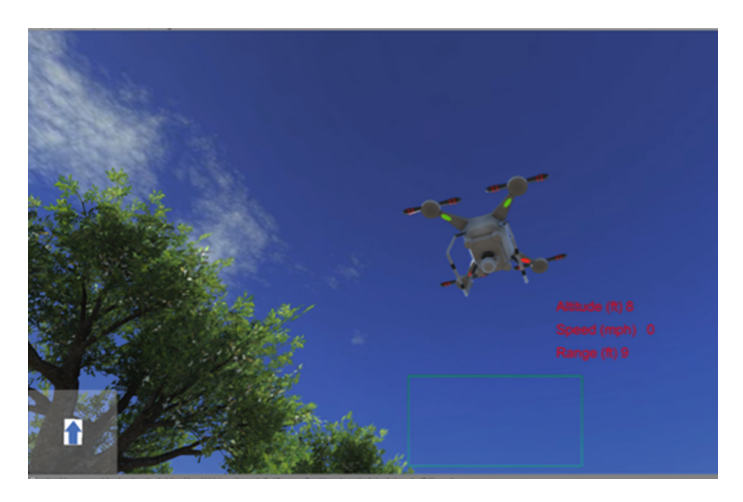
Fig. 1. Virtual environment (probably need one with the Jeep in it or some other target)

nominal dimensions of 30 \text{ cm} \times 30 \text{ cm} \times 10 \text{ cm} and has red lights indicating the forward part of the drone and blinking green lights in the rear of the unit. The VE is of a generic rolling hills environment that contains some natural environment features such as trees, a lake, and several man-made features such as a jeep, tents, and recreational vehicles. The latter were used in the second part of the test when the participant was asked to locate and proceed to one of these targets.