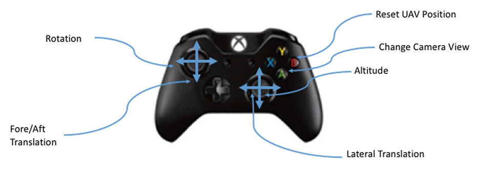
Fig. 2. Joystick controller

Multiple hand models come with the LMC. These range from basic hand models shown in Fig. 4 below to robotic looking hands to humanoid looking hands. For this investigation the user could roll the left hand about the z-axis for the vehicle to yaw and pitch it about the x-axis for a forward and aft motion. A rotation of the right hand around the z-axis results in a left/right translation of the vehicle while a right hand rotation around the x-axis results in a change in altitude. One final capability was via the use of the LMC based user interface to control the camera. It is a slick capability available in the Orion Version of the API [13]. In this case a UI is attached to the left hand and is visible when that hand is rotated toward the user as shown in Fig. 5 below. In this case the interface enabled the view selection from either the view of the operator or the view from the camera. The view from the camera assists in identifying targets.