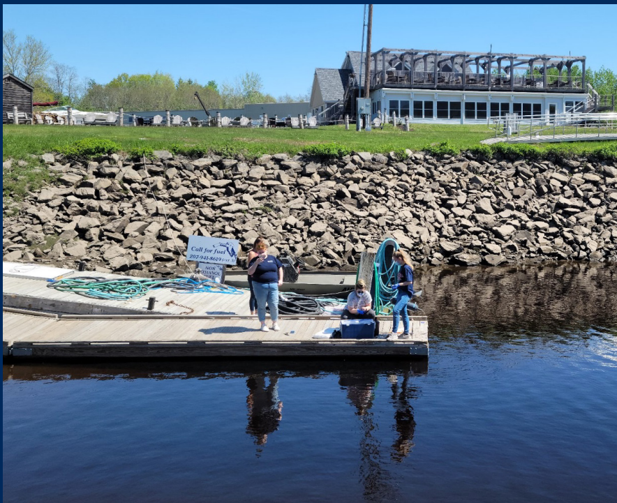
Maine-eDNA students practice collecting water samples.

Maine EPSCoR is overseen by the Maine Innovation Economy Advisory Board, a statewide steering committee of individuals from Maine's education, research, and business communities and state government. The board is under the auspices of Maine's Office of Innovation.