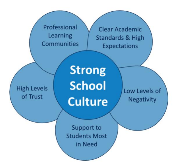
Figure 2 Strong School Culture

The elements of a strong school culture as described by Moosung and Louis (2019).