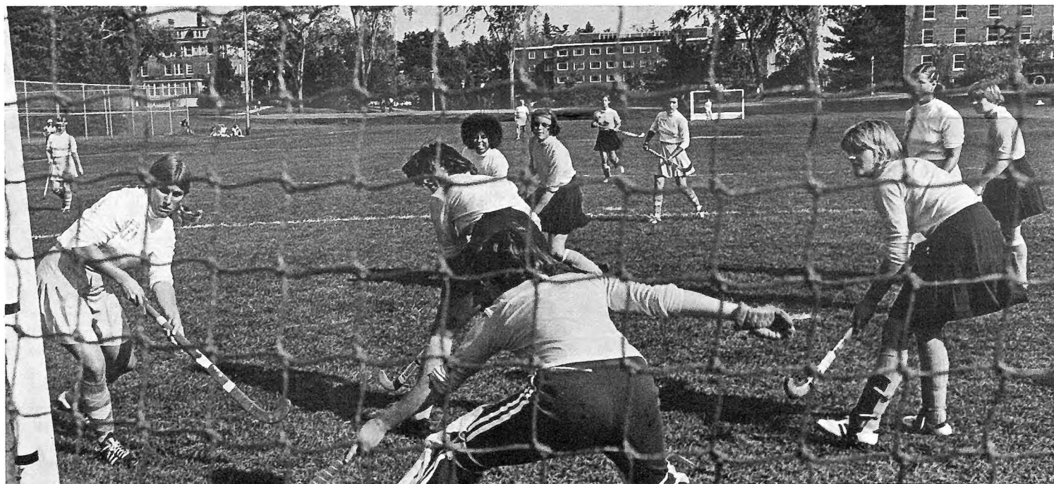
FIELD HOCKEY AT LENGYEL FIELD