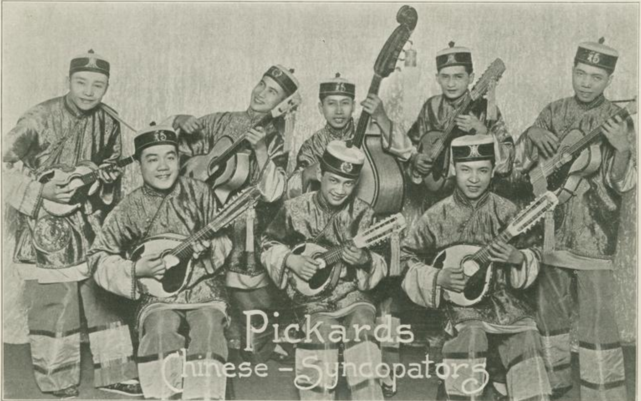
Pickards Chinese - Syncopators