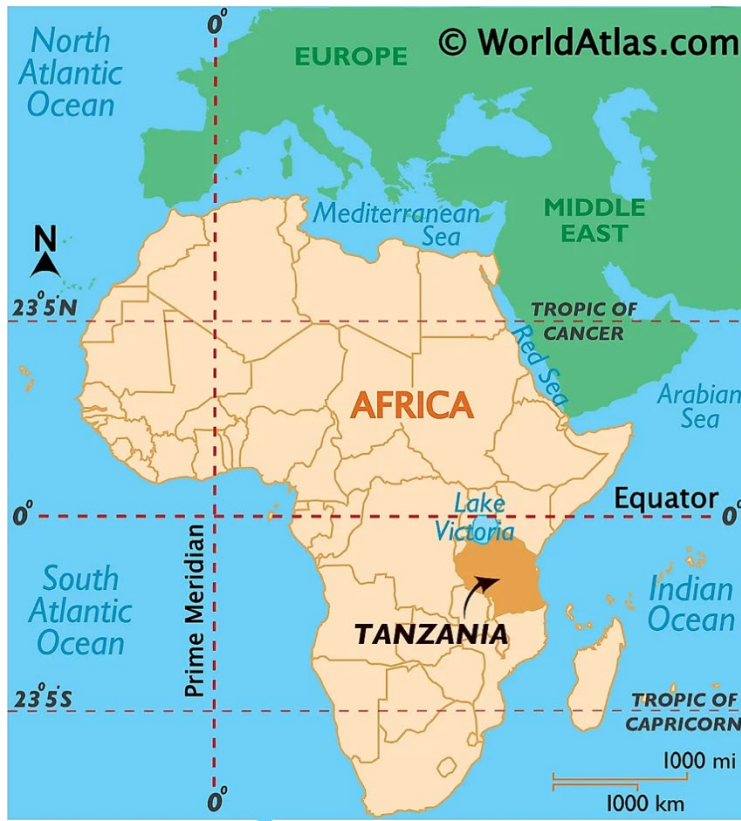
Figure 1. Tanzania is found on the coast of East Africa, bordering Kenya, Mozambique, Malawi, Zambia, the Democratic Republic of Congo, Burundi, Lake Nyanza (the colonial name is Lake Victoria) and the Indian Ocean. 124

Lodge. "Visit Us at Mafia Kivulini Lodge, Mafia Island, Tanzania." Business. Mafia Kivulini Lodge, 2021. http://mafiakivulinilodge.com/ . Chole Mjini. "Chole Mjini Treehouse Lodge." Business. Chole Mjini, 2022. https://www.cholemjini.com/ ; Kinasi Lodge. "Kinasi Lodge – Mafia Island, Tanzania." Business. Kinasi Lodge, 2021. http://www.kinasilodge.com/ .