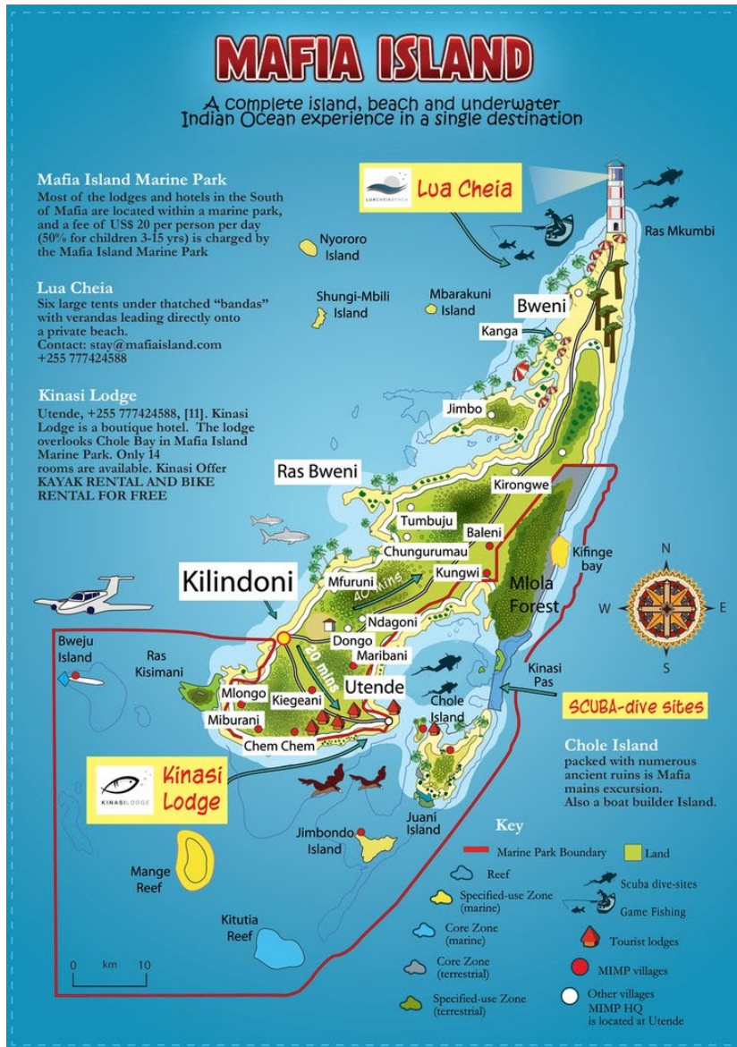
Figure 2. This map was produced for tourists by a Zanzibar Scuba company, and it shows many of the villages, beaches, activities, and the Mafia Island Marine Park boundaries. The different zones colored on the map have stringent rules for local people regarding fishing and sea ecosystem maintenance. 125