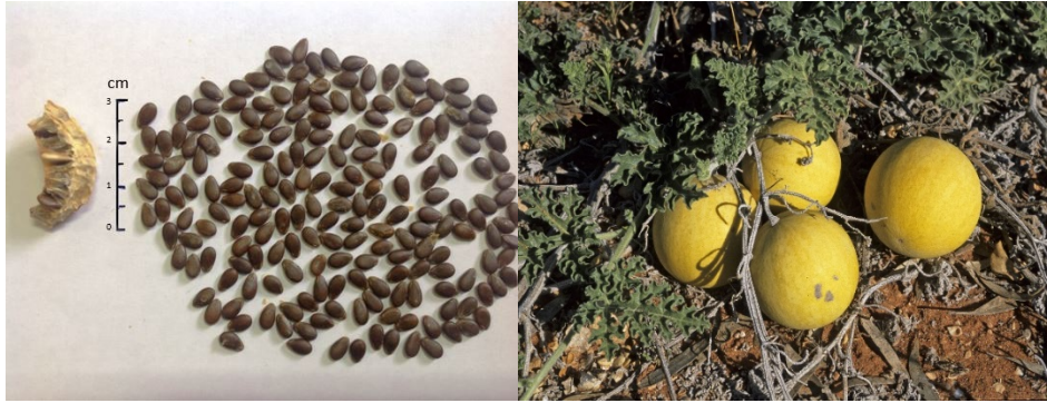
Fig 2. Sample of colocynths seeds showing a part of mesocarp and the brownish ripped seeds.

Phenology: This species starts vegetative growth at mid-May. Floral buds appear from mid-July but full flowering stage happens at late August. Fruits appear at mid-July and ripe in September. Finally seed ripening and shedding occur in October and November respectively.