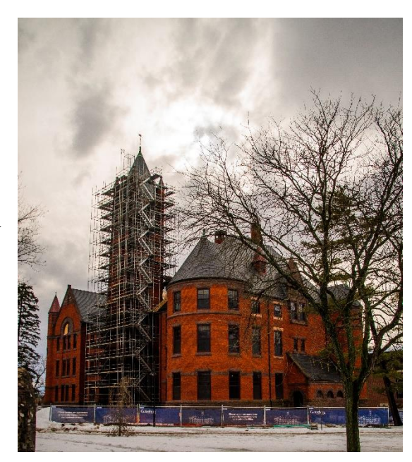
Glatfelter during the 2014-15 renovations

Like the 1928-29 renovation, this project completely altered the interior of the building. According to Jim Biesecker, the Director of Facilities at the time, the building had water seeping through the foundation, requiring excavation, waterproofing, and other major repairs.<sup>46</sup> While classrooms and offices were removed to trailers on Constitution Avenue's lot, crews dug a trench around the building to waterproof walls and the hall's slab. Indeed, the foundation's floor was removed to allow better drainage, more concrete, and better ventilation equipment. Furthermore, for the first time, fire-Glat suppression sprinklers were installed along with other