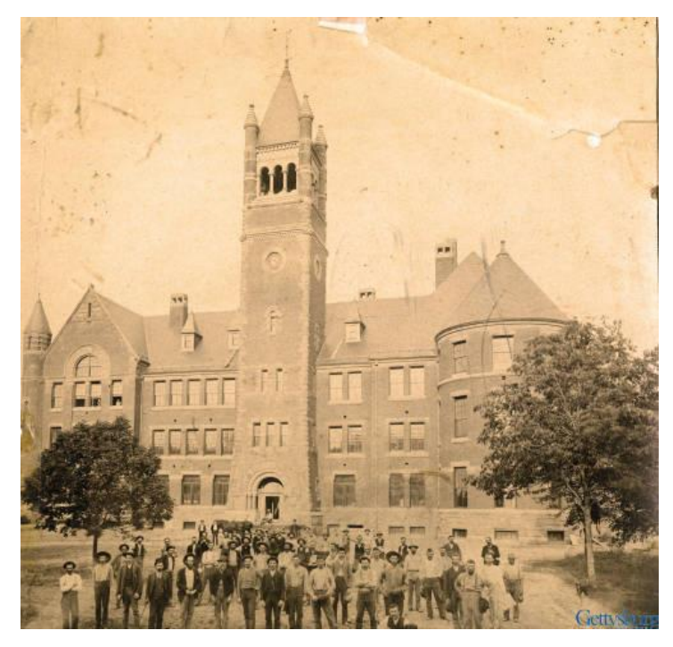
The construction team posing in front of a completed Recitation Hall, 1889. Note the lack of a clock face on the tower.

By September 1889, the New Recitation Building was completed. Coinciding with the dedications of about 80 Pennsylvania monuments on the Gettysburg Battlefield, the ceremony was a grand one.<sup>23</sup> In town for the other dedications, sitting Governor James Beaver served as master of ceremonies. The College Monthly wrote that this event was meant to be held outside, but because of rain, it was held on the third story of the new building. Despite the worries of low attendance between the other ceremonies and the weather, the College Monthly wrote that "happily, this