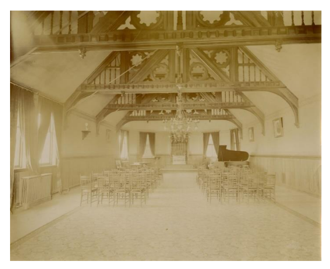
Philo Meeting Room

Glatfelter Hall has three floors and a basement. The basement initially was used for physics lecture, but later, became a storage location. On the first floor was the president's office and the library, and the museum collections formerly in Linnaean Hall were placed on the third floor near the infirmary. In addition, the two literary societies (Philomathean and Phrenakosmian) moved their libraries and meeting rooms to this building following the spring of 1889.<sup>29</sup>