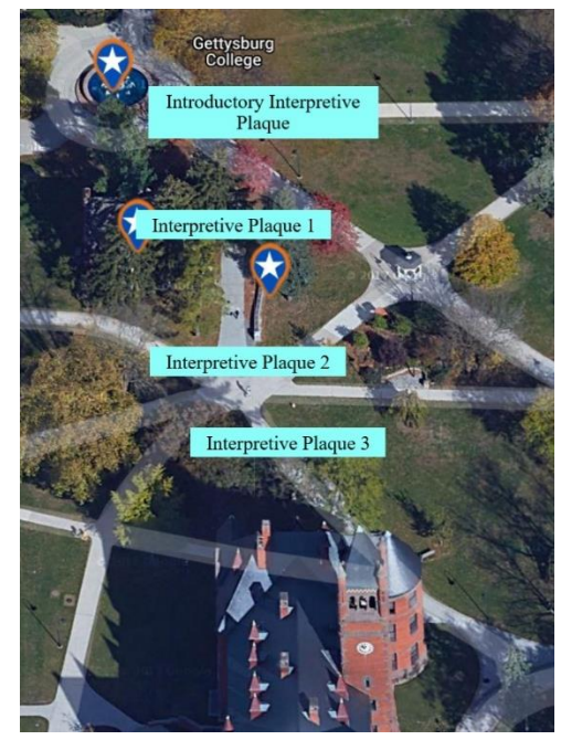
The approximate location of the initial four plaques (plaques would all be placed on the left side of the walkway in a fairly prominent and easy to view and see location for maximum accessibility).

The National Park Service's Historic American Buildings Survey called Glatfelter Hall the "facility which is at the heart of the academic program of Gettysburg College." Until the proliferation of other academic buildings constructed during the mid-20<sup>th</sup> century, over 90% of classes were held in this building. As of the late 1980s and early 1990s, Glatfelter Hall held over 30% of all classroom space and 40% of academic office spaces on campus, percentages which likely have not changed significantly since. Even if students do not attend classes in Glatfelter, its presence over campus is noticeable; no matter where one is, they can always hear the antique bells in Glatfelter's clocktower tolling. The following interpretive plaques will explore the history and significance of this landmark building.