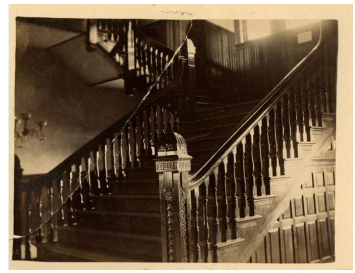
The original staircase, c. 1890

showing a continuity within the story of this historic building.<sup>36</sup> This project resulted in the classrooms being plastered, blackboards installed, new lighting, a new fireproof (concrete) structure, cork tile, and, most exciting, the marble staircase that is now iconic of the building.<sup>37</sup> Following the restructuring, part of the Engineering and the Military Science department were in the basement, the Math, Greek, and German department as well as administration