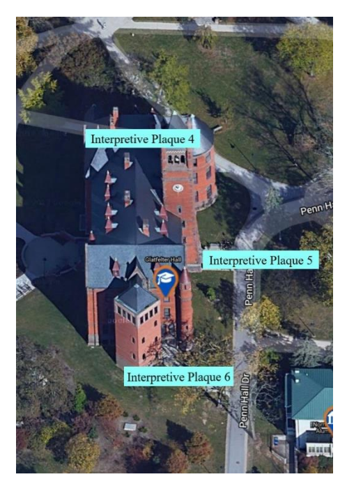
The approximate location of interpretive plaques around the structure of Glatfelter Hall. (plaques would be placed further away from the building and closer to the walkways for maximum visibility).

In December 1929, students tried to rally President Hanson for a day off to celebrate the overwhelming defeat of perennial rival Franklin and Marshall in a Thanksgiving Day football game. Hanson responded that Glatfelter was finally ready after its renovation and that students should "take immediate advantage" of the building. The Gettysburgian reports that disappointed students "trudged through the thickly falling snow" to attend their classes in the reopened hall.