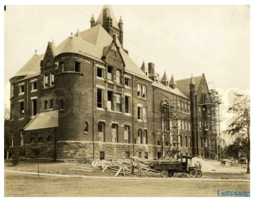
Glatfelter Hall during the 1929 renovation

This project began after commencement in 1929 and lasted until after the Thanksgiving Break. The Gettysburgian noted on September 19, 1929, that it would be the first time in 48 years the hall would not be available, writing that workmen were spending three eight hour shifts, "both day and night" to finish the project.<sup>35</sup> Interestingly enough, two men who