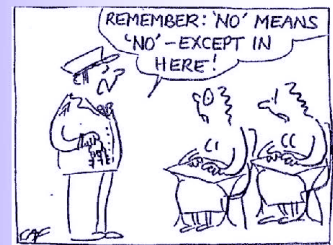
Figure III: Postcard designed by CAEFS for their #HereMeToo campaign to end strip searching.

To: The Honourable Ralph Goodale Minister of Public Safety House of Commons Ottawa, Ontario Canada K1A 0A6