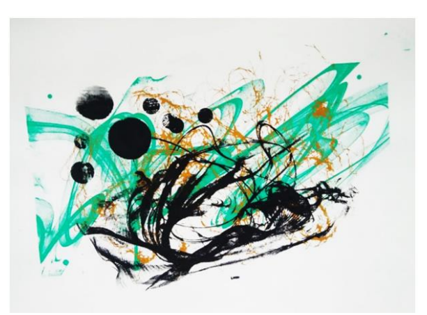
Figure 4. A paper copy of The artwork (B).

The second step was to make a copy of each artwork, since the goal of printing is supposed to be making a number of copies that are easy to obtain. So, the layers were printed again on papers for the two smaller artworks as in (Figure 4) and the larger artwork was printed on glossy paper, a problem with the process of drying the colours was encounter in this stage thus, a fixator was sprayed onto the papers after a week from printing. This stage could be skipped if the right size of papers was available but the dimensions were (130x70cm) as in (Figure 5).