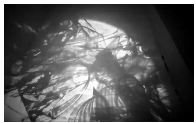
Figure 7. picture of casting a light upon the artwork (A)