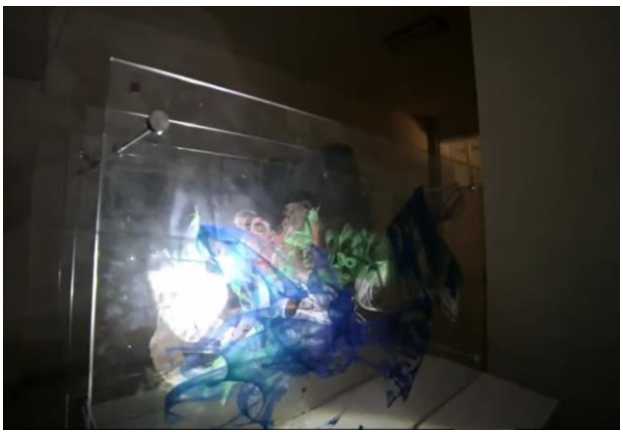
Figure 6. The artwork (A). coloured silk screen print on hardened glass of three layers. (130x70cm).

The third step was to transform the artwork from one that the viewer moves around into one that the viewer takes part in the process of combinational formations, in other words making the viewer part of the artwork. This was achieved by placing the artwork in a dark room and casting a light upon it, in a way that it produces endless combinational formations through casting the shadows of the printed shapes on a wall and the intersections of the shadows as well (video attached). In this way the viewer is fully surrounded by the artwork depending on the lights' directions and the positions of the casted shadows.