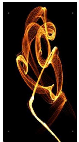
Figure 1. sketch made by using Flame Painter Pro 3 software.

The first step was to prepare the original draft which was to be used on the silk screen. Some sketches were made by using Flame Painter Pro 3 software as in (Figure 1). At that point the brush type, size and colour were chosen and a number of drawings were made accordingly. later, those shapes were processed using Photoshop to control the size of the artwork alongside its resolution. The images were transformed into halftones as in (Figure 2), some were dotted, the others were striped. This division was made in order to fit with the imprints on the silk screens and to make those shapes preserve the existence of every dot in the artwork's space. Next, we processed each of the drawings by exposing the screen, which was coated with a sensitive substance, to light.