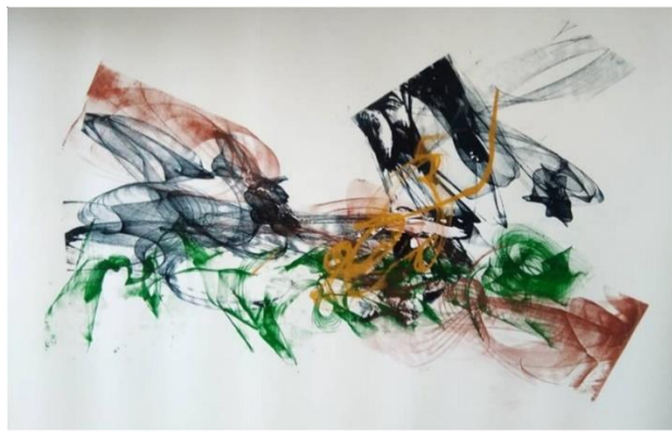
Figure 5. A paper copy of The artwork (A).

The third step was to transform the artwork from one that the viewer moves around into one that the viewer takes part in the process of combinational formations, in other words making the viewer part of the artwork. This was achieved by placing the artwork in a dark room and casting a light upon it, in a way that it produces endless combinational formations through casting the shadows of the printed shapes on a wall and the intersections of the shadows as well (video attached). In this way the viewer is fully surrounded by the artwork depending on the lights' directions and the positions of the casted shadows.