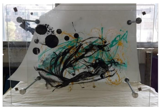
Figure 3. the glass boards fixed together using a metal rail.

One of the difficulties while printing was choosing the type of inks that would leave a trace on glass boards and in this same time when exposed to light, they would block it from passing through which allows the shape to be clear when projected. The colours of the transparent silk screen, as the name indicates, were not enough to block the light. When the experiment was repeated acrylic colours were tried and the result was great because they fulfilled the aforementioned requirements. When the layers were done, the glass boards were fixed together using a metal rail that was prepared to join the boards in a way that leaves an equal space between every board and the other which was around 20cms as in (Figure 3).