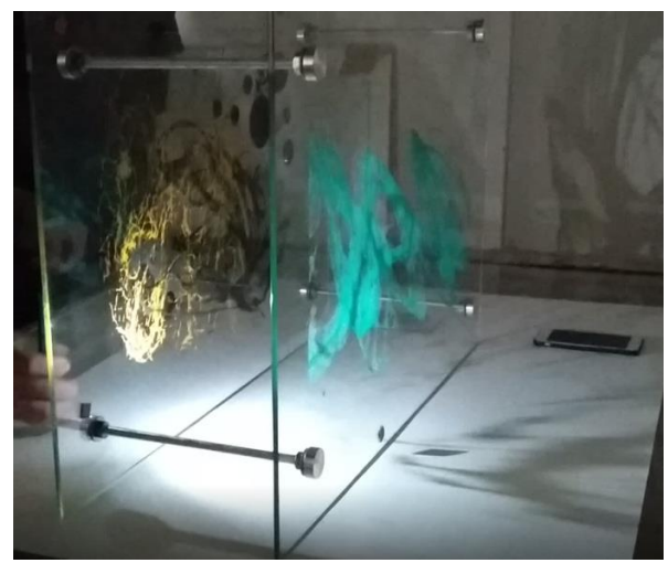
Figure 8. The artwork (B). coloured silk screen print on hardened glass. of two layers (70x40cm).

Figure 7. picture of casting a light upon the artwork (A)