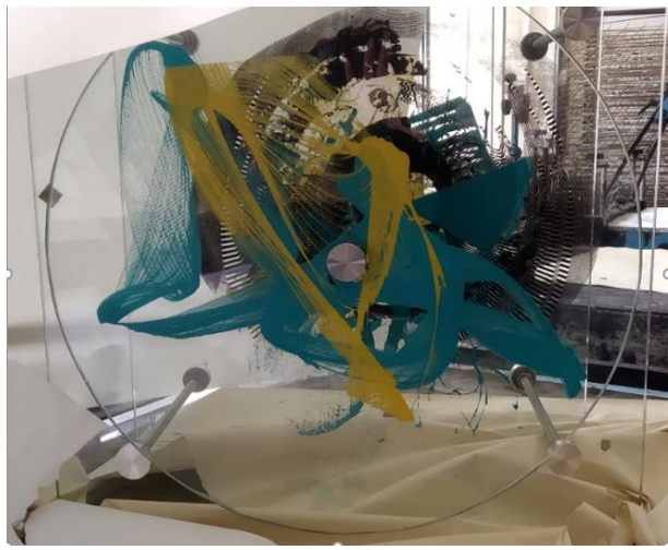
Figure 10. The artwork (C). coloured silk screen print on hardened glass of three layers. The first one is round and fixed from the middle. (50x50cm).