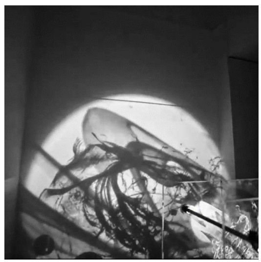
Figure 9. picture of casting a light upon the artwork (B)