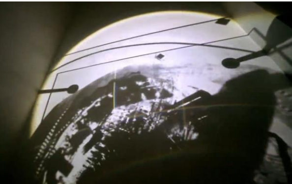
Figure 11. pictures of casting a light upon the artwork (C)