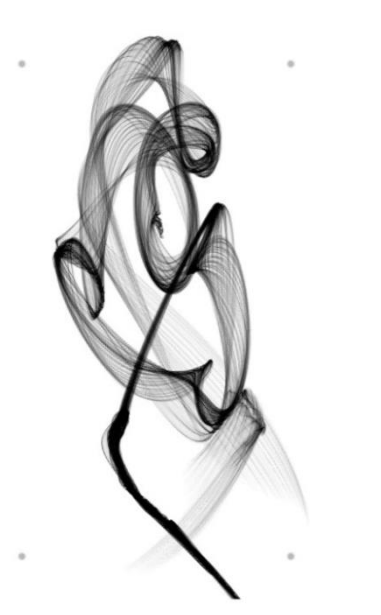
Figure 2. The transformed sketch into halftones.