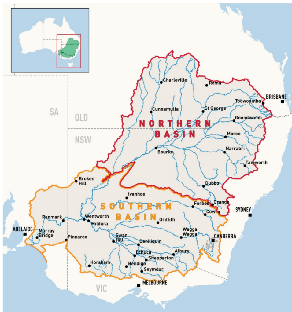
Fig. 1. Murray-Darling Basin in Australia.

in resources for prosecutions, illegal bores and the potential overuse of stock and domestic water, historically received minimal inspector attention (Matthews 2017; NSW 2017).