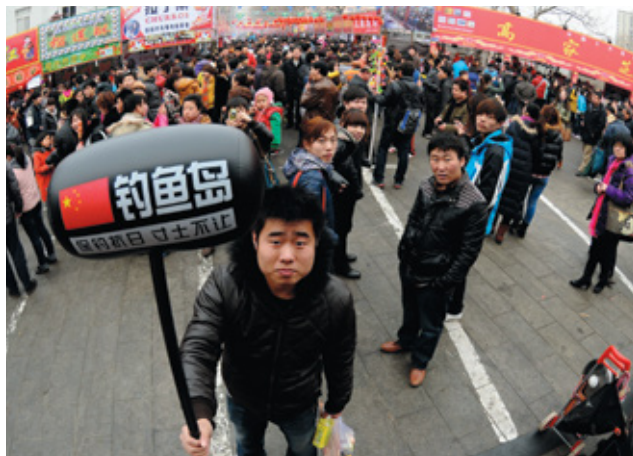
A man holding an inflatable sign declaring that the Diaoyu Islands are Chinese sovereign territory, location unknown.

Complicating this situation is the potential involvement of Taiwan — an equally flammable subject from Beijing's perspective, notwithstanding the diplomatic truce that has largely remained in place since Ma Ying-Jeou's election as President of Taiwan in March 2008. In January 2013, a Japanese Coast Guard vessel fired water cannons at a Taiwanese boat carrying activists intending to land on the Senkaku/Diaoyu Islands. In a similar episode involving the Philippines, another US ally, a diplomatic crisis erupted in May 2013 after a Taiwanese fisherman was shot dead by a Philippine law enforcement vessel in the disputed waters of the South China Sea.