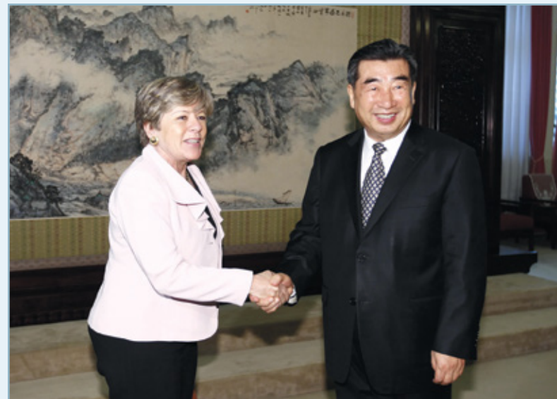
Alicia Bárcena, executive secretary of Comisión Económica para América Latina y el Caribe (CEPAL), meeting with Vice Premier Hui Liangyu.