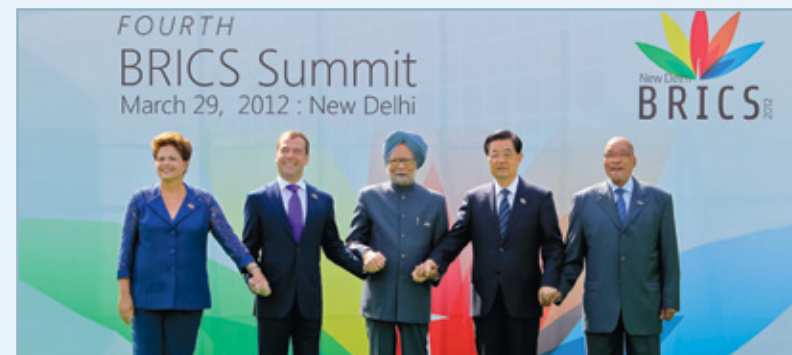
The leaders of the BRICS countries.

The next summit is scheduled to take place in Brazil in 2014.