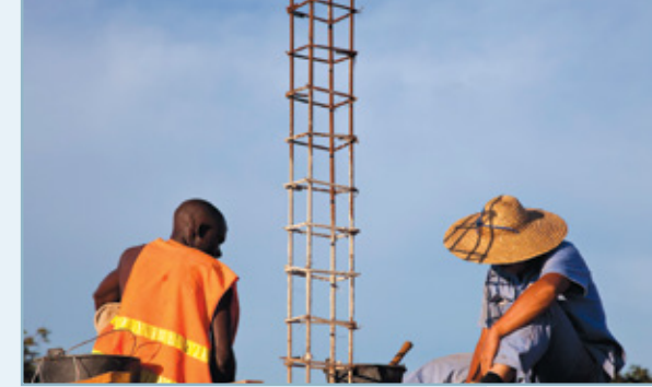
Chinese and African workers sit side by side.

China takes our primary goods and sells us manufactured ones. This was also the essence of colonialism. Africa is now willingly opening itself to a new form of colonialism.