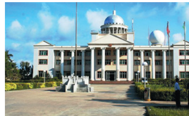
Government building, Sansha city.