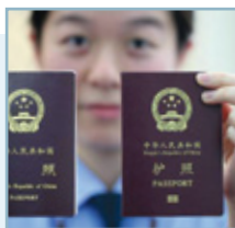
The old passport and the new side by side.