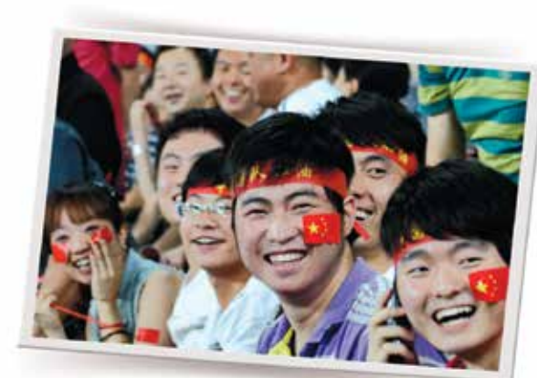
Chinese football fans, Guiyang, June 2011.

A s China becomes wealthier and more confident on the global stage, it also expects to be respected and accommodated as a major global force — and as a formidable civilisation. Through a survey and analysis of China’s regional posture, urban change, social activism and law, mores, the Internet, history and thought — in which the concept of ‘civilising’ plays a prominent role — China Story Yearbook 2013 offers insights into the country today and its dreams for the future.