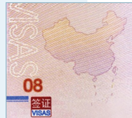
Controversial map in the new passport.

In Taipei, the Mainland Affairs Council issued a statement reprimanding Beijing for including territories that the latter did not have ‘authority to govern’ ( tongzhiquan 統治權). In a subsequent statement, the Council distinguished ‘authority to govern’ from Republic of China sovereignty ( zhuquan 主權), which claims to cover mainland China. The convoluted definition of the controversial ‘one China with respective interpretations’ ( yi Zhong gebiao 一中各表) principle meant, however, that Taiwan didn’t need to act to avoid implicitly endorsing sovereignty claims on the latest passports issued by the People’s Republic. Taiwan has always issued separate entry permits for mainland Chinese visitors to be used alongside mainland travel documents. Taiwan officials only place stamps on these permits.