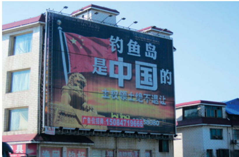
Slogan on the façade of a building reading 'Diaoyu Islands belong to China'.

... the rivalry between the Soviet Union and the United States was like a boxing match. They tried to knock each other down to the point of death. But China and the United States try to win a game by scoring points. They try to win with smartness, strength and good strategy. There will be no major violence.