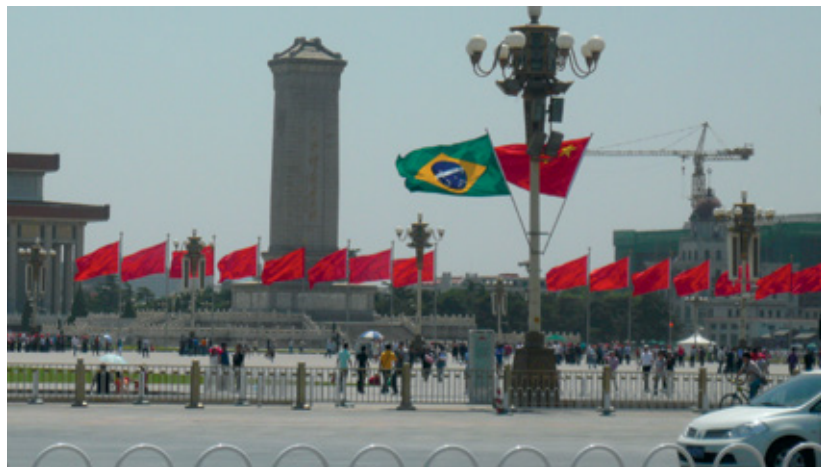
Flags of China and Brazil flying on Tiananmen Square.