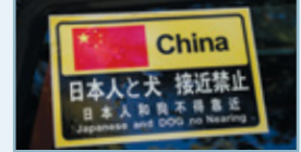
A car sticker in Beijing reading: 'Japanese and DOG no Nearing.'

The People's Daily publishes an op-ed by China Academy of Social Sciences academics Zhang Haipeng and Li Guoqiang calling for a reassessment of Japan's sovereignty over the Ryukyu Islands, which includes Okinawa (but not the Diaoyu/Senkaku Islands).