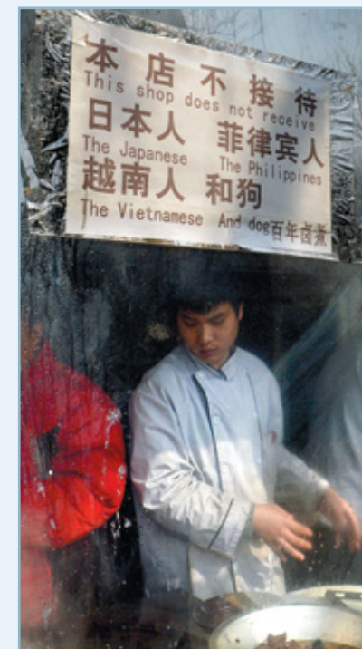
Beijing restaurant sign reading ‘This shop does not receive The Japanese The Philippines The Vietnamese And dog’.

The sign was taken down on 28 February 2013.