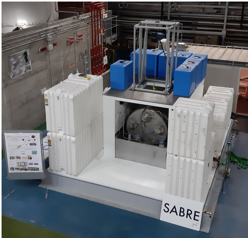
Figure 2. The SABRE Proof of Principle setup in hall C of LNGS. A side of the cylindrical veto vessel with five PMT housings is visible in the centre of the polyethylene shield, which is surrounded by water tanks. The removable structure mounted on top of the shielding is the crystal insertion system.

is currently limited by the presence of cosmogenic isotopes so we first focused on alpha decays that can be easily identified by the charge-weighted mean-time. Alpha activity turned out to be (0.48 \pm 0.01) mBq/kg but we also found indications that most of this rate is due to ^{210}\text{Po} decays from a ^{210}\text{Pb} contamination out of equilibrium. The current analysis activity is focused on the development of noise rejection algorithms and on energy threshold reduction with the intent to better understand the low energy region of the spectrum and to produce a first background model capable to assess crystal contaminations.