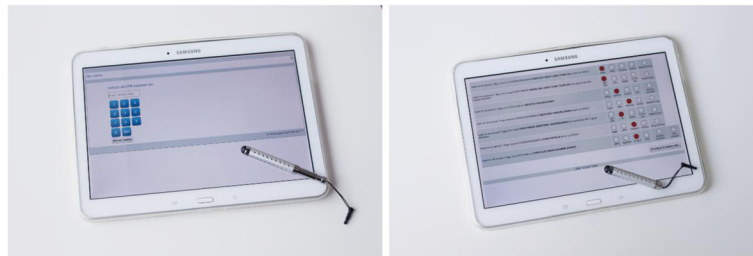
Fig. 1 Patients log on to the tablet computer using the unique civil registration number and complete the PRO-CTCAE questionnaire in the waiting room

Throughout the entire study period, support was provided on site by the researcher.