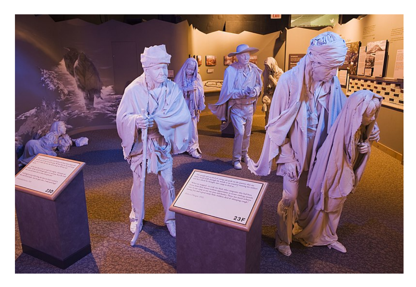
Figure 2: This image depicts some of the types of Cherokee travelers forced on the Trail of Tears (National Archives and Records Administration 2019). These types of images of weary and impoverished Native Americans have become infused with public perception over Indigenous "true" identity (Orr et al. 2019:2, 12).