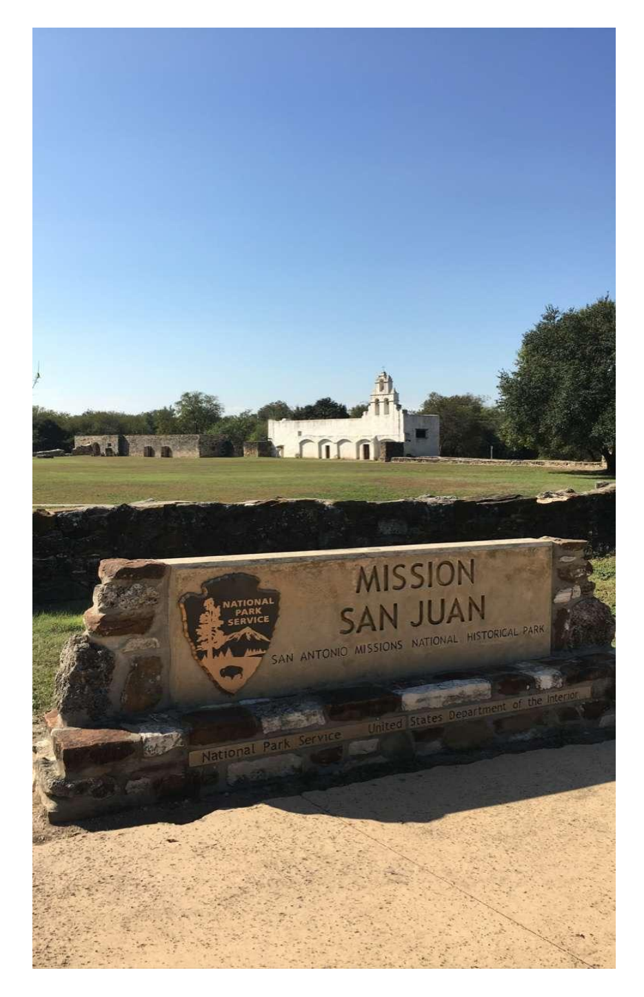
Figure 4: This photograph taken by the author depicts Mission San Juan Capistrano in San Antonio (Brown 2021). Over 150 people including children were reburied here in 1999 and the early 2000s as part of a huge repatriation effort by Tāp Pīlam.