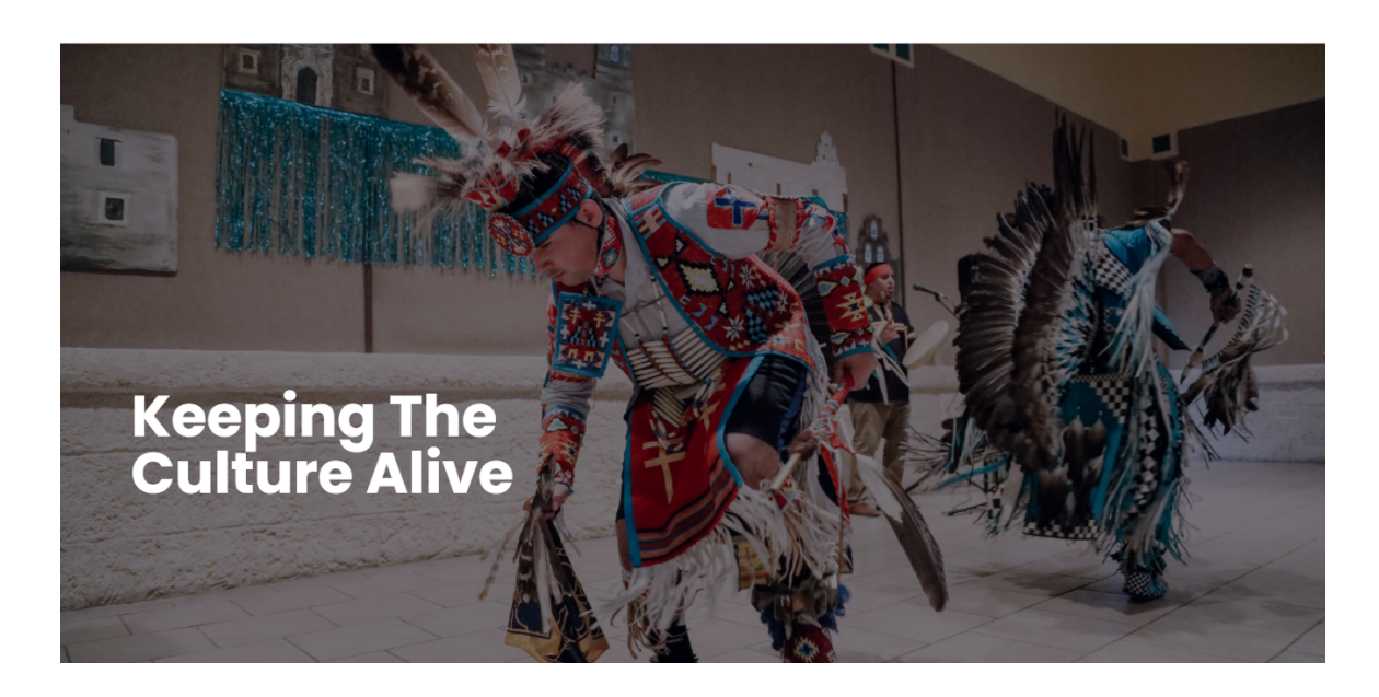
Figure 5: This photograph taken by AIT-SCM is displayed on the landing page of AIT's website. It beautifully demonstrates the ways that Tāp Pīlam is continuing the teachings, ceremonies, and language (to name a few cultural practices) to fight the erasure of their people (AIT-SCM N.d.).