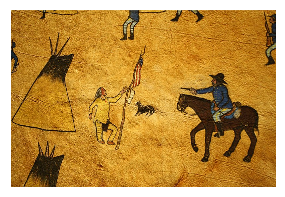
Figure 1: Native Americans have been victims of cultural, biological, and physical genocide. This image (likely painted on deerskin) depicts Black Kettle, a Southern Cheyenne leader at Sand Creek, in 1864 holding up an American flag while being attacked by Colonel Chivington's unit under false pretenses of being hostile (Wikimedia Commons and Stone Rabbit 2012).