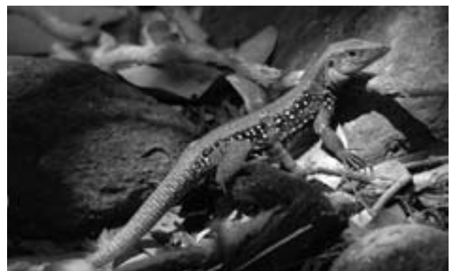
JOHNS PARMELLE JR.

Ameiva fuscata (Garman 1887). Squamata: Teiidae. Local name: Abòlò. English common name: Dominican Ground Lizard. Endemic. These large ground lizards (maximum male SVL 200 mm, maximum female SVL 154 mm) occur in lowland habitats such as coastal scrub, plantations, and open forests, but also may range to moderate elevations along road edges and in artificial clearings. Lizards have elongated pointed snouts and long, stocky tails. Smaller individuals are a mottled brown with light blue spots dorsally; large males have a black, slate-gray, to dark blue ground color with light blue spots. These lizards may run on their hindlimbs (bipedal) when engaged in chases or when frightened. Ameiva fuscata is a dietary generalist that feeds opportunistically, usually employing an active-foraging strategy, often in groups. It typically consumes arthropods, but will eat fallen fruit and small vertebrates, and is known to prey on Iguana delicatissima eggs and hatchlings. Lizards are most active at high temperatures and under direct sunlight, although they avoid the extreme mid-day heat. The conservation status of the species has not been assessed, but it is locally abundant and one of the most frequently seen lizards on Dominica.