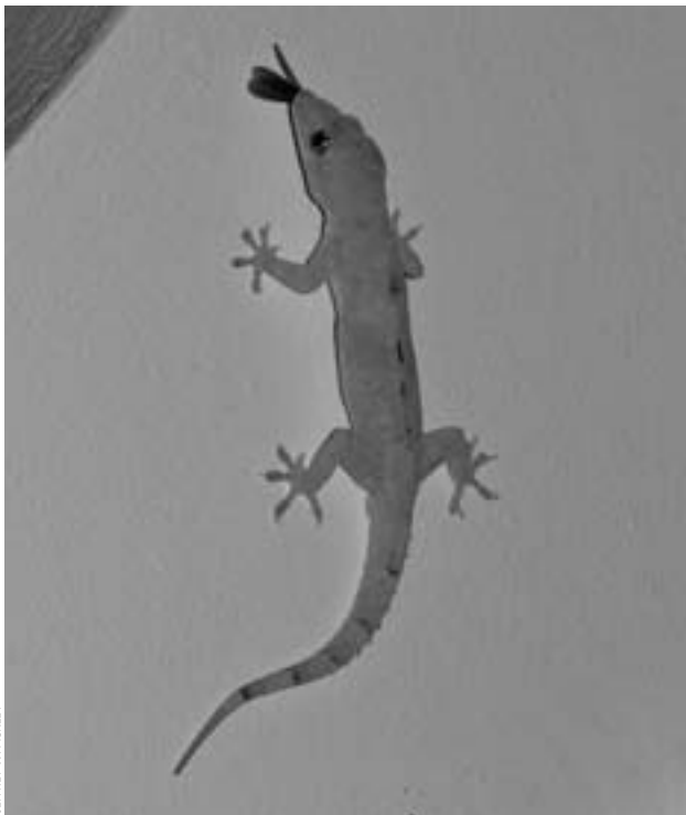
JEFFREY W. ACKLEY

Hemidactylus mabouia (Moreau de Jonnès 1818). Squamata: Gekkonidae. Local name: Mabouya Kai. English common names: Common House Gecko, Cosmopolitan House Gecko. These geckos, with populations in Africa and throughout the Neotropics, are human commensals. Whether the population on Dominica arrived by natural or human-mediated means is unknown. The nocturnal lizards (maximum male SVL 68 mm, maximum female SVL 61 mm) occur on walls and roofs of buildings and under loose concrete, logs, and rocks. They are pale but often change color in response to their habitat. Individuals found on the ground under loose bark and logs may be whitish gray to light brown, with bands on their backs. These lizards are frequently observed eating insects around lights at night. Their conservation status has not been assessed.