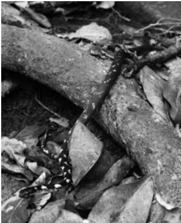
LAUREN A. WHITE

Alsophis antillensis (Schlegel 1837). Squamata: Colubridae. Local names: Kouwès Nwè, Koulèv. English common name: Dominican Racer. Lesser Antillean endemic; the subspecies A. a. sibonius is a Dominican endemic (other subspecies occur on neighboring islands). These diurnal snakes (maximum female and male SVL 905 mm) occur in rain forest, rain forest edges, coastal scrub, mountain pastures, mangrove edges, deciduous forests, and orchards/plantations. Adult coloration is dark taupe through milk chocolate to very dark brown, dark slate gray, and jet black with white, cream, or light brown blotches. Juveniles have a distinct pattern that becomes obscured with age as a result of increased pigment deposition. These snakes are predominantly diurnal, with activity peaks at mid-morning and late afternoon. Species of Alsophis feed primarily on lizards (especially anoles), but may consume a variety of terrestrial vertebrates such as frogs, birds, rodents, and sometimes other snakes. They use a combination of active foraging and ambush foraging strategies, and may extend activity into the night to hunt anoles eating insects attracted to artificial lights. Their conservation status has not been assessed.