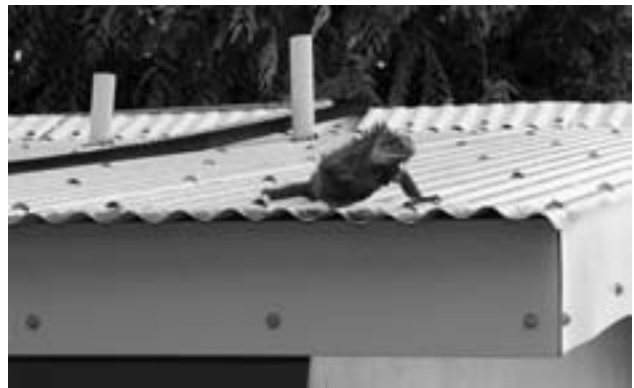
JOHN S. PARNELLE, JR.

ularly venture onto the ground. Color varies greatly. Hatchlings are bright green, but this fades with age to dark gray with hints of green, blue, brown, and occasionally pink around the snout and facial features. Males tend to be darker than females, which frequently retain a primarily green coloration into maturity. Males have larger heads, prominent dewlaps, and conspicuous femoral pores on the undersides of their thighs. Individuals spend much of their time adjusting body positions and perch heights to regulate body temperatures. The diet includes flowers, fruits, and leaves of many plants. Iguanas are quick to exploit introduced ornamentals and appear to have a particular fondness for hibiscus. Juveniles are known to eat bird eggs, and iguanas of all ages may scavenge. Adults have few predators except humans and the occasional boa, but major predators on eggs and hatchlings include crabs, rats, and Ameiva fuscata . The species is included