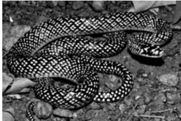
JEFFREY W. ACKLEY

Liophis juliae (Cope 1879). Squamata: Colubridae. Local names: Kouwès jenga, Kouwès zenga, Grove Snake. English common names: Dominican Ground Snake, Leeward Ground Snake. Lesser Antillean endemic; the subspecies L. j. juliae is a Dominican endemic (other subspecies occur on Guadeloupe and Marie-Galante). These diurnally active, ground-dwelling snakes (SVL to 458 mm) occur in rain forest, cut-over hardwoods, and dry forest. Ground color is typically black with a “salt and pepper” pattern of white to yellow spots. Communal nests have been found. These active foragers feed primarily on small vertebrates, including frogs, lizards (especially anoles), and lizard eggs. Less frequently encountered and presumably less abundant on Dominica than Alsophis antillensis , the conservation status of the species is unknown.