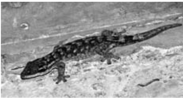
JEFFREY W. ACKLEY

Windward Dwarf Geckos ( Sphaerodactylus vincenti monilifer ) occur in leaf litter of upland rain forests and habitats modified for agriculture to elevations as high as 900 m. These geckos are much less frequently encountered on Dominica than S. fantasticus . Sphaerodactylus vincenti is sexually dimorphic. Males have two black “eye-spots” (ocelli) on the shoulders, whereas females lack ocelli, but have light spots on the shoulders.