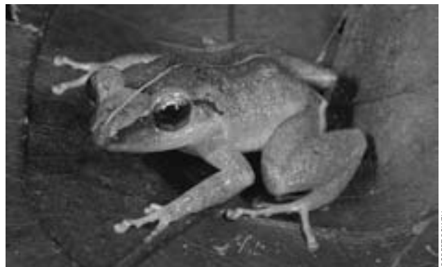
Like many relatives, patterns of Martinique Frogs ( Eleutherodactylus martinicensis ) are highly variable. This individual has a faint middorsal line, but others may be unicolored, blotched, or have very distinct dorsal “racing” stripes.

Eleutherodactylus martinicensis (Tschudi 1838). Anura: Eleutherodactylidae. Local name: Tink Frog. English common names: Martinique Frog, Martinique Robber Frog. This Lesser Antillean endemic is presumably native on Dominica, although it may have been imported inadvertently by early European settlers. These small frogs (maximum male SVL 32 mm, maximum female SVL 47 mm) occur from sea level to at least 1,250 m in varied natural and altered habitats that include rain forests, dry woodlands, banana and coconut plantations, and gardens. This species has a pointed snout and relatively small toepads. Males have a bi-lobed glandular vocal sac and produce a two-note call. Dorsal color is brownish to reddish; other markings are highly variable. These nocturnal frogs may call by day during or after