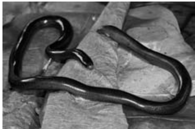
JEFFREY W. ACKLEY

Typhlops dominicanus (Stejneger 1904). Squamata: Typhlopidae. Local names: Kouwès dé-tèt, Koulèv, Coffin Borer. English common name: Dominican Blindsnake. Endemic. These burrowing snakes (maximum SVL 385 mm) occur in well-shaded areas under rocks and logs, but may be encountered on the surface after heavy rains. They have a small, blunt head with scales covering the rudimentary eyes and a short tail equipped with a ter-