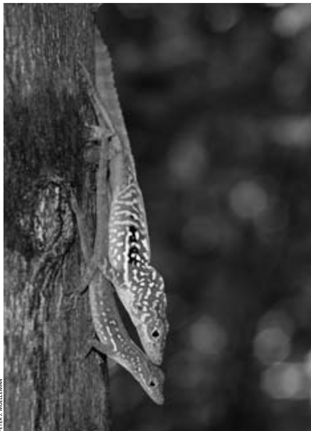
PETER J. MUELEMAN

Like many relatives, Dominican Anoles ( Anolis oculatus ) exhibit sexual size dimorphism, with males much larger than females. This is generally seen in species in which males compete with one another for mates.