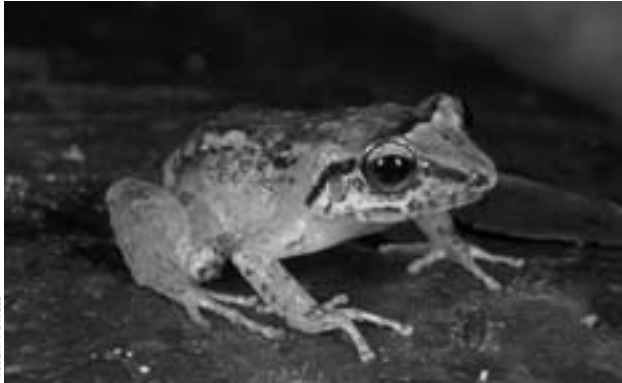
The endangered Dominican Frog ( Eleutherodactylus amplinympha ) is restricted to moist forests at higher elevations.

Eleutherodactylus amplinympha (Kaiser, Green, and Schmid 1994). Anura: Eleutherodactylidae. Local name: Dominican Gounouj. English common names: Dominican Frog, Dominican Rain Frog, Dominican Whistling Frog, Endemic. These relatively small frogs (maximum male SVL 26 mm, maximum female SVL 50 mm) occur at elevations >300 m in montane rain forest, where they perch on trees, palm brakes, moss mats, epiphytes, and ferns. This species has a pointed snout and relatively large toepads. Males have bi-lobed glandular vocal sacs and produce a three-note call. Dorsal color varies from brownish to greenish to reddish, and, as in other frogs in the genus, pattern elements are highly variable. These largely nocturnal frogs are known to call by day in wet forests during or after heavy rains. The species is included on the IUCN Red List as “endangered,” primarily due to its restricted range, high likelihood of habitat loss attributable to human expansion, volcanism, or hurricanes, and the potential threat posed by chytridiomycosis, a fungal infection to which upland amphibians in the tropics appear to be particularly vulnerable.