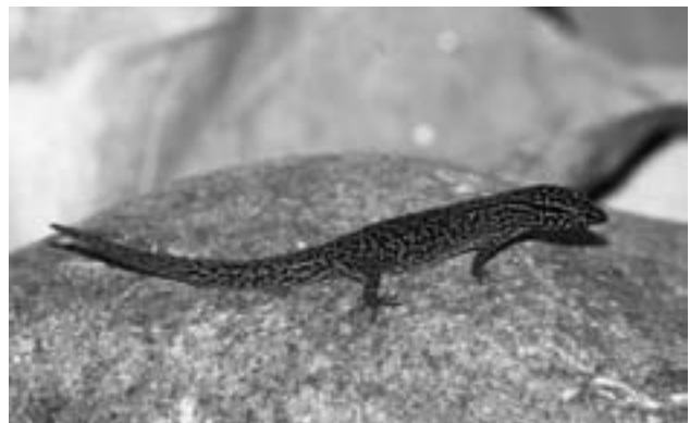
NELSON J. VELEZ ESPINET

South Leeward Dwarf Geckos ( Sphaerodactylus fantasticus ) are sexually dimorphic. Males (top) have very dark heads with light spots, whereas females (bottom) are more distinctly patterned, but have striped heads.