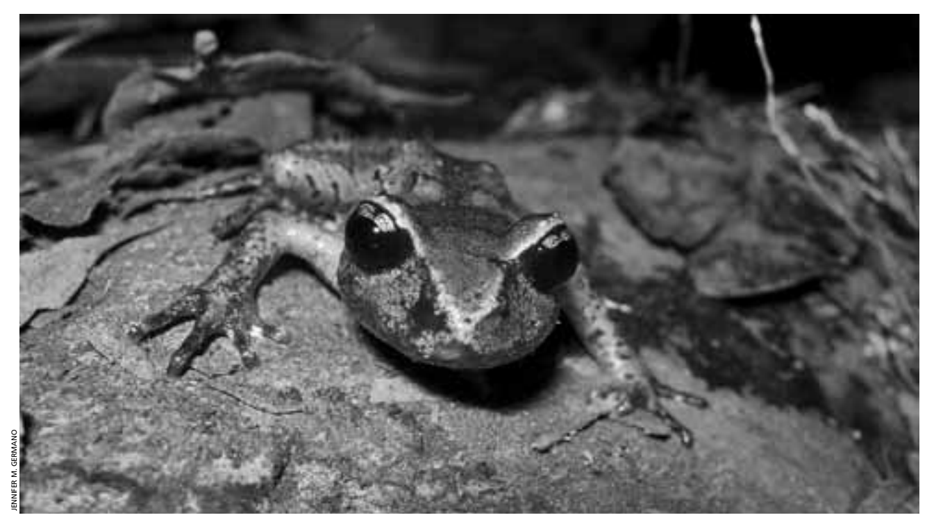
The Maud Island Frog (Leiopelma pakeka) is endangered in New Zealand and listed as "vulnerable" on the IUCN Red List.

Well, we're about to find out. In the next five to ten years, about half of the different kinds of animals that make up the Class known as amphibians probably will become extinct. There are about 6,000 known species in the class of amphibians: frogs, toads, and salamanders take in most of them. As I write this, 32 percent of those 6,000 are threatened, and another 23 percent are believed to be threatened (we don't have quite enough data to make the call with absolute certainty).