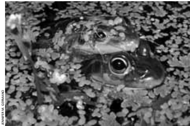
The Southern Bell Frog ( Litoria raniformis ) is endangered in Australia and listed as such on the IUCN Red List. However, introduced populations in New Zealand currently are doing well — but may be susceptible to the chytrid fungus, which has been documented in New Zealand during the past decade.