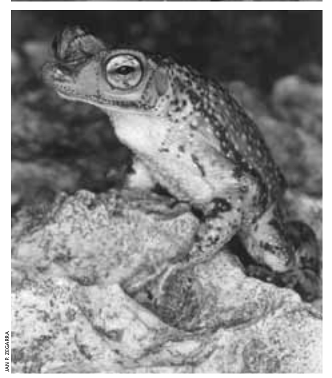
Captive-breeding programs, including that at the St. Louis Zoo, are working to reestablish the critically endangered Puerto Rican Crested Toad ( Bufo lemur ) in its natural habitat.