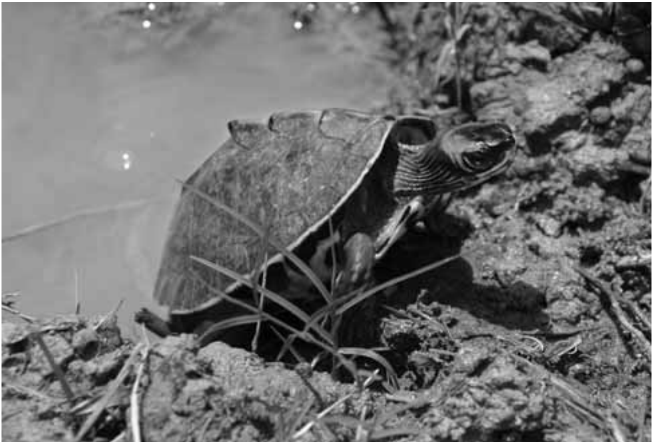
Indian Roofed Turtles ( Pangshura tectum ) are popular in pet markets in Dhaka.