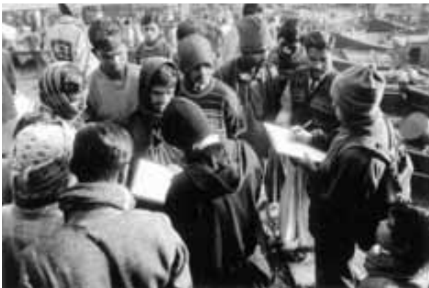
Local people often were a good source of information for finding amphibians and reptiles in unfamiliar areas.