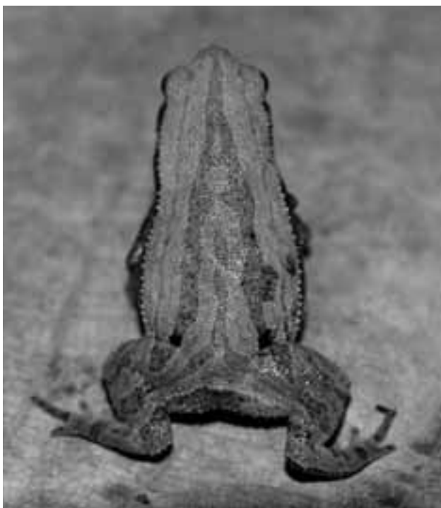
We recorded the Sticky Frog ( Kalophrynus interlineatus ) for the first time in Bangladesh from Madhupur National Park.