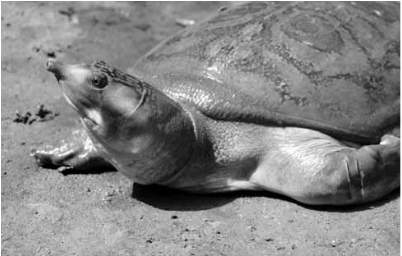
Indian Softshell Turtles ( Aspideretes gangeticus ) are still common in large rivers like the Brahmaputra and its tributaries.