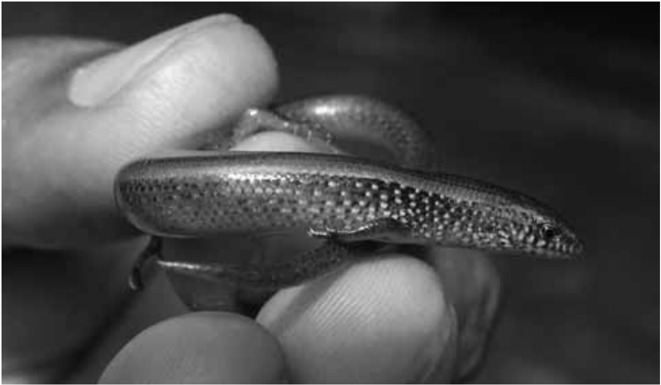
We recorded Bowring's Supple Skink ( Lygosoma bowringii ) for the first time in Bangladesh.