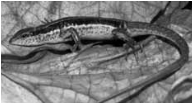
Spotted Litter Skinks ( Sphenomorphus maculatus ) are common, but were recorded for the first time from Comilla Tipperah Hills.

ochracea ) and a very fast-moving Trinket Snake ( Coelognathus radiatus ), inside our "well-protected" hillside resort campus. We also collected several species of skinks, the most important of which were Lygosoma lineolatum , which had not been described in earlier records, Sphenomorphus maculatus , which we had found already in the Camilla Tiperah Hills, and Eutropis macularia , which was quite common in the area. We spent more than an hour capturing a Calotes versicolor sleeping high in a tree at night inside the resort. Mountain streams are quite common in these three hill districts, and we recorded a megophryid frog, Xenophrys parva , by one such stream.