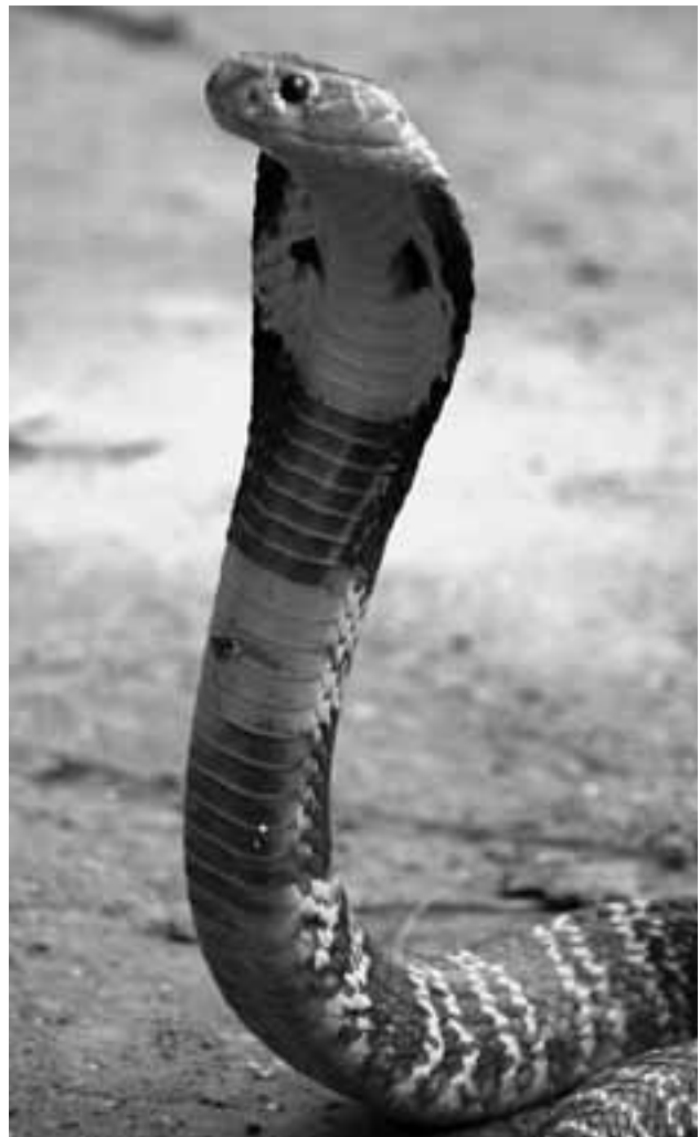
The dangerously venomous Spectacled Cobra ( Naja naja ) is the main attraction for snake charmers in Bangladesh.

I end my story on Katka Beach, situated south of the Sundarbans mangrove forest, on a crisp and gorgeous day, with no one else to enjoy the wide swath of powdery white sand beach that stretched from horizon to horizon. The Earth's biodiversity is being lost at a frightening rate, and we must act now to conserve our life support system. We humans, who have been given the power and wisdom to achieve so much, should recognize that protecting ecosystems and wildlife will ultimately ensure our own survival. Bangladesh is an impoverished, overpopulated, beleaguered, and mostly forgotten country, but those of us from southern Asia have a headstart on the rest of the world because of our positive attitude towards nature. We