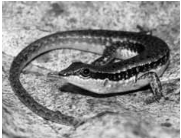
Reeves's Ground Skink ( Scincella reevesii ), another first record for Bangladesh.

secretive and very difficult to locate, but I found several fresh roadkills on the road that meanders through the 8,438-hectare deciduous forest in north-central Bangladesh. We recorded a brightly colored microhylid, Kalophrynus orangensis , which has recently been proposed to be synonymous with K. interlineatus , for the first time in Bangladesh. Kaloula taprobanica , another dark, painted microhylid also was collected from a head-high