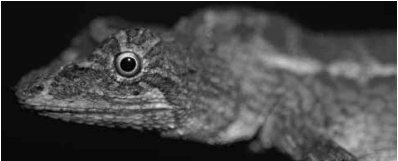
The Green Fan-throated Lizard ( Ptyctolaemus gularis ) was recorded for the first time in Bangladesh.