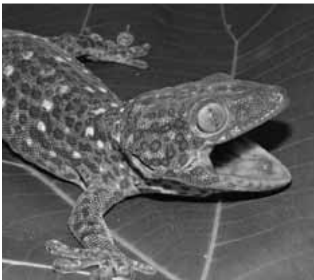
Brightly colored and noisy Tokay Geckos ( Gekko gecko ) are common in most old buildings.

servation strategic plan. Thus, this mainly Muslim, impoverished, overpopulated, and poorly explored country is now drawing attention from researchers and conservationists around the globe. As a native, I wanted to initiate a research and conservation program on the herpetofauna of Bangladesh, the least known and most neglected group of animals in the country. My research goals included the production of an updated species list, a set of GIS-based distribution maps, and estimates of species composition and richness in various habitat types.