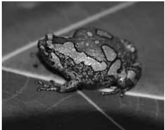
We found a Sri Lankan Painted Frog ( Kaloula taprobanica ) in a head-high tree-hole.