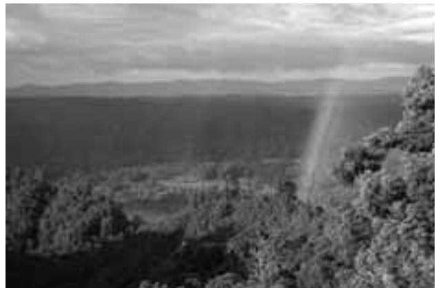
The Khagrachari, Bandarban, and Rangamati hill districts are covered in evergreen forests.

UNESCO "World Heritage Site," and an important wintering and breeding ground for migratory birds. Water depths in the Haor vary from 5–10 m during the wet season and 1–4 m in some shallower wetland areas. We hired a boat especially designed to cruise in shallow water, but could not conduct a thorough survey this year because of logistical problems. We are planning to do so in the coming years. We did, however, record several species of common frogs and aquatic snakes (e.g., Enhydryis enhydryis , Xenochrophis piscator , etc.). We also found a few softshell turtles ( Aspideretes gangeticus and A. hurum ) that had been captured by local turtle hunters who we encountered on the way to local fish markets. We collected tissue samples for DNA analyses.