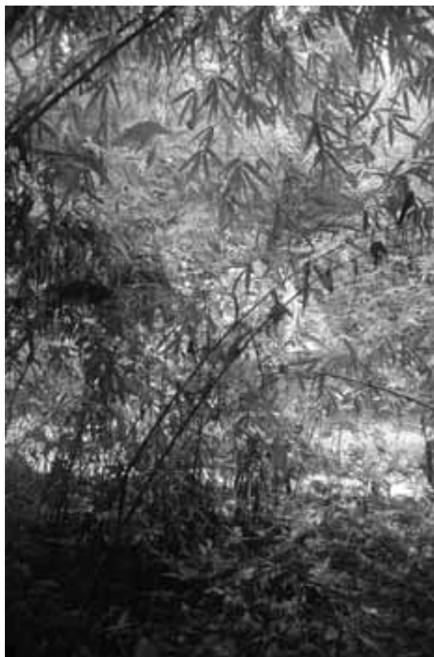
Lawachara National Park is a 1,250-hectare, highly diverse evergreen forest.

reported from the country were also recorded: Scincella reevesii , a common ground-dwelling skink, and Ptyctolaemus gularis , a relatively uncommon Calotes -like agamid lizard that we found about 2 m high on a tree-trunk.