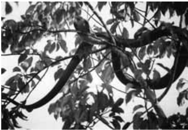
A good population of King Cobras ( Ophiophagus hannah ) remains only in the Sundarbans mangrove forest.

My final destination was the Sundarbans, the largest chunk of productive mangrove forest in the world, and another World Heritage Site that extends through both India and Bangladesh. At the mouth of the mighty Ganges, this wide area of impenetrable mangroves supports a varied and fascinating array of natural and anthropological treasures. The Bangladeshi Sundarbans covers an area of about 5,770 km 2 , of which 4,016 km 2 is land and the rest is composed of rivers, canals, and creeks. Only a couple of centuries ago, the Sundarbans was twice its current size, but much of it has been altered. It is a crucial conservation area hosting Bengal Tigers ( Panthera tigris tigris ) and many other species, including the world's largest venomous snake, the King Cobra ( Ophiophagus hannah ), and the world's largest living reptile, the Estuarine Crocodile ( Crocodylus porosus ). This mangrove area also is one of the world's most effective cyclone barriers, and also serves as a food factory capable of feeding our children in perpetuity. Transport in the Sundarbans is difficult and dangerous, especially during the cyclone months. We rented a boat and launched from Khulna, the last human habitation in the northern part of the Sundarbans, and spent most of the time onboard. Our little "Titanic" carried several thousand gallons of freshwater and enough food for the whole team to eat, drink, and take showers for an entire week.