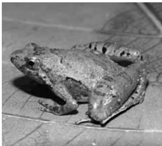
Uncommon Berdmore's Narrow-Mouthed Frog ( Microhyla berdmorei ) is found frequently in Madhupur National Park.

Three mountainous districts occur in southeastern Bangladesh: Khagrachari, Bandarban, and Rangamati. These are covered in forests that extend from Myanmar and northeastern India, and are highly diverse, mostly intact, and poorly explored. Getting there required an eight-hour bus journey from Dhaka to Chittagong, then a three-hour bus ride to Bandarban, and finally a "chander gari," a locally produced four-wheel-drive jeep-like vehicle. My western friend had to get special permission, as foreigners are not normally allowed to visit these politically restless districts. While looking for amphibians and reptiles in the area, local people were constantly providing us information on sightings of frogs, snakes, and lizards. In response to such information, we were able to capture a Cat Snake ( Boiga