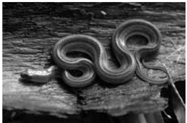
Common Smooth Water Snakes ( Enhydryis enhydryis ) are common in most wetlands in Bangladesh.