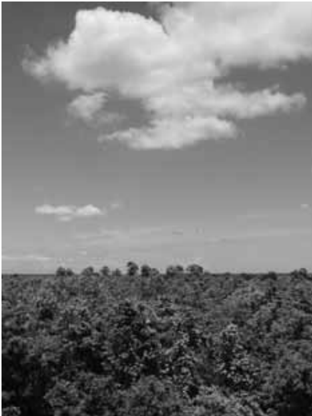
Undulating red soil and Sal forest are the main ecological features of the deciduous forest.

secretive and very difficult to locate, but I found several fresh roadkills on the road that meanders through the 8,438-hectare deciduous forest in north-central Bangladesh. We recorded a brightly colored microhylid, Kalophrynus orangensis , which has recently been proposed to be synonymous with K. interlineatus , for the first time in Bangladesh. Kaloula taprobanica , another dark, painted microhylid also was collected from a head-high