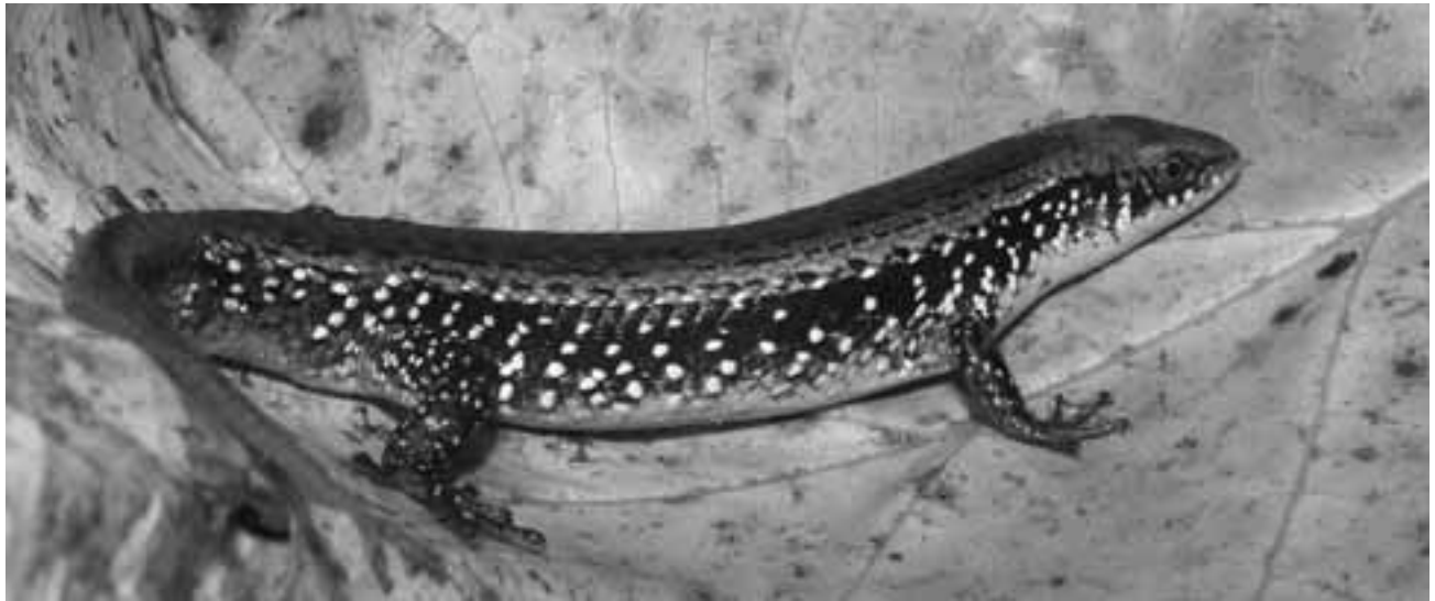
This small Bronze Grass Skink ( Eutropis macularia ) is widely distributed in plains and hilly areas throughout the country.