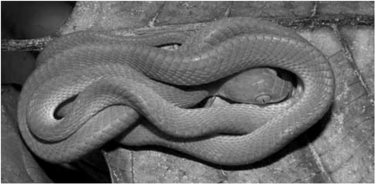
The mildly venomous nocturnal Tawny Cat Snake ( Boiga ochracea ) was only found in the Bandarban Hills.