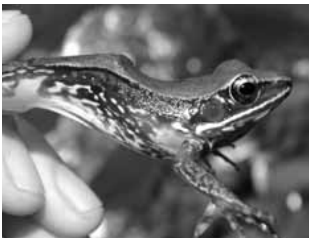
Like many other Asian ranids, Sylvirana leptoglossa has been subjected to prolonged taxonomic debates.

tree-hole. This is the first voucher specimen of this species from the country. Many Asian ranids have been subjected to a long taxonomic debate. We recorded an abundance of the noisy Rana leptoglossa (the recently revised name of which is now Sylvirana leptoglossa ) from the park, and this also was a first record of the species from the region. We noticed the Berdmore's Narrow-Mouthed Frog ( Microhyla berdmorei ) in great abundance during late-June.