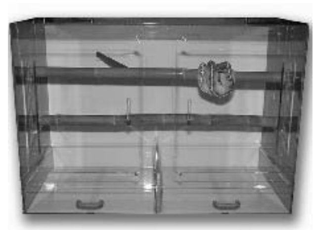
Minimalist enclosures appropriately emphasize the inhabitant.