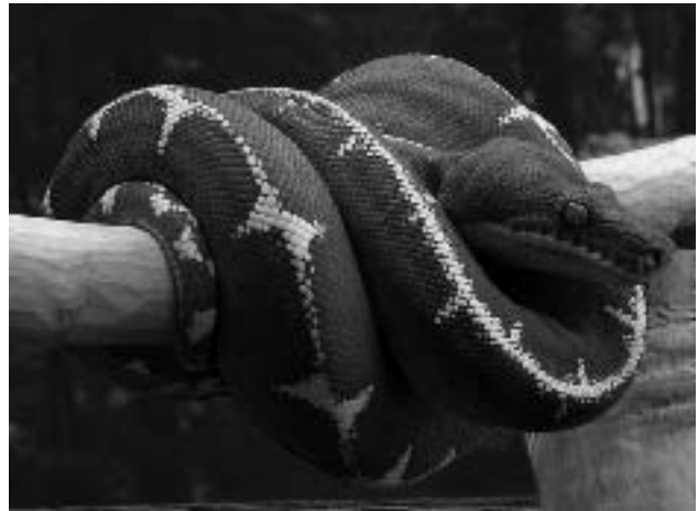
Adult male Corallus caninus showing the slit pupils associated with nocturnal activity, the heat-sensitive pits that locate prey and direct strikes even in the absence of light, and the characteristic posture assumed by Emerald Tree Boas.

Whereas aesthetic considerations will influence the selection of cage furnishings to some degree, the most ergonomically efficient minimalist designs require less of virtually everything. Focusing on the inhabitant as the primary attraction and minimizing the number of decorative items will minimize maintenance time and allow for greater budget flexibility, especially when considering larger colonies.