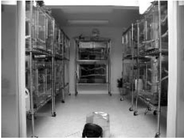
Facility for housing Emerald Tree Boas showing tall cages with large openings that allow ready access for maintenance. Note the humidifier in the foreground; controlling the environment of an entire room precludes the duplication of control mechanisms for each enclosure.

refined techniques for the maintenance of precise atmospheric conditions in greenhouses, and these same strategies can be successfully applied to housing C. caninus .