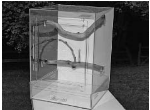
Easily modified, lightweight plastic enclosures with perches at several heights facilitate maintenance of proper temperature and humidity.