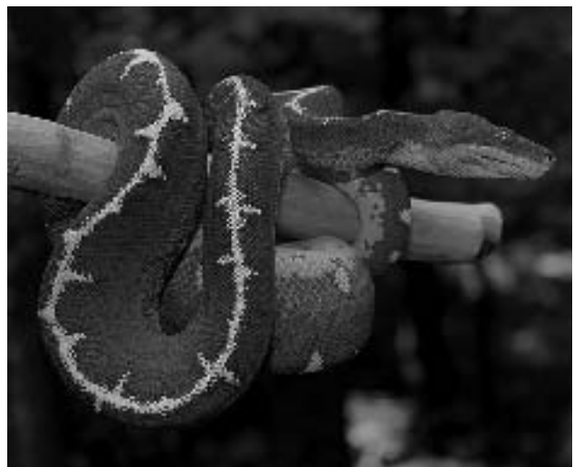
Adult male Corallus caninus demonstrating the color and "personality" that causes these snakes to be so prized by hobbyists.

Depending on the nature of the facility, minimalist habitats within environmentally controlled rooms may consist of as little as two perches and a water source. Although such setups have proven ideal and are commonly parts of larger collections, the majority of herpetoculturists employ environmentally independent self-contained habitats. Such units require additional hardware to achieve and sustain the continuous levels of temperature and humidity necessary to maintain Neotropical