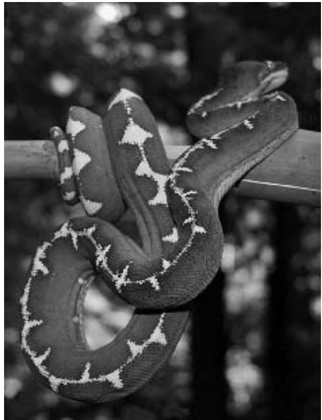
The extent, continuity, and pattern of white markings in Corallus caninus vary considerably in different parts of the species' natural range (see also Iguana 12:2–7).

In nature, Emeralds are exclusively arboreal primary rainforest dwellers that thrive within a relatively narrow range of conditions. Until recently, this combination was quite challenging to recreate within a captive environment. Maintaining moderate ambient heat, high relative humidity (RH), and continuous air circulation was difficult enough, but attempting to balance these elements to within the specifications of a Neotropical rainforest habitat have traditionally proven all but impossible for the average herpetoculturist. As a result, even today, appropriate captive habitats are still relatively uncommon. Interestingly, however, long before the advent of hi-tech gadgetry, horticulturists had