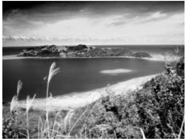
Yadua Taba Island photographed from Yadua island in 1979. The patches of grassland seen in this photo are now mostly covered by regenerating forest.

Crested Iguanas are more robust than Banded Iguanas and are easily distinguished by a high crest of enlarged middorsal scales from the nape to the base of the tail. Ground color in both males and females is green, with black-edged, narrow white transverse bands along the body and tail. Like the Banded Iguana, the Crested Iguana can change its background color from various shades of green to almost black in a matter of minutes. In captivity, the Crested Iguana can produce multiple clutches in a single season (Boylan 1989). Clutch size varies from two to seven eggs, with an average of four (Bach 1998). On the Crested Iguana Sanctuary island of Yadua Taba (pronounced Yandua Tamba in Fijian), lizards apparently lay only a single clutch each year in the mid-wet season (February to March), with the first hatchlings appearing at the end of October (personal observation). This suggests an incubation period of seven to eight months in the field, exceptionally long for any lizard. In captivity, incubation periods have ranged from 4 1/2 months (Boylan 1989) to 9 1/2 months (Bach 1998).