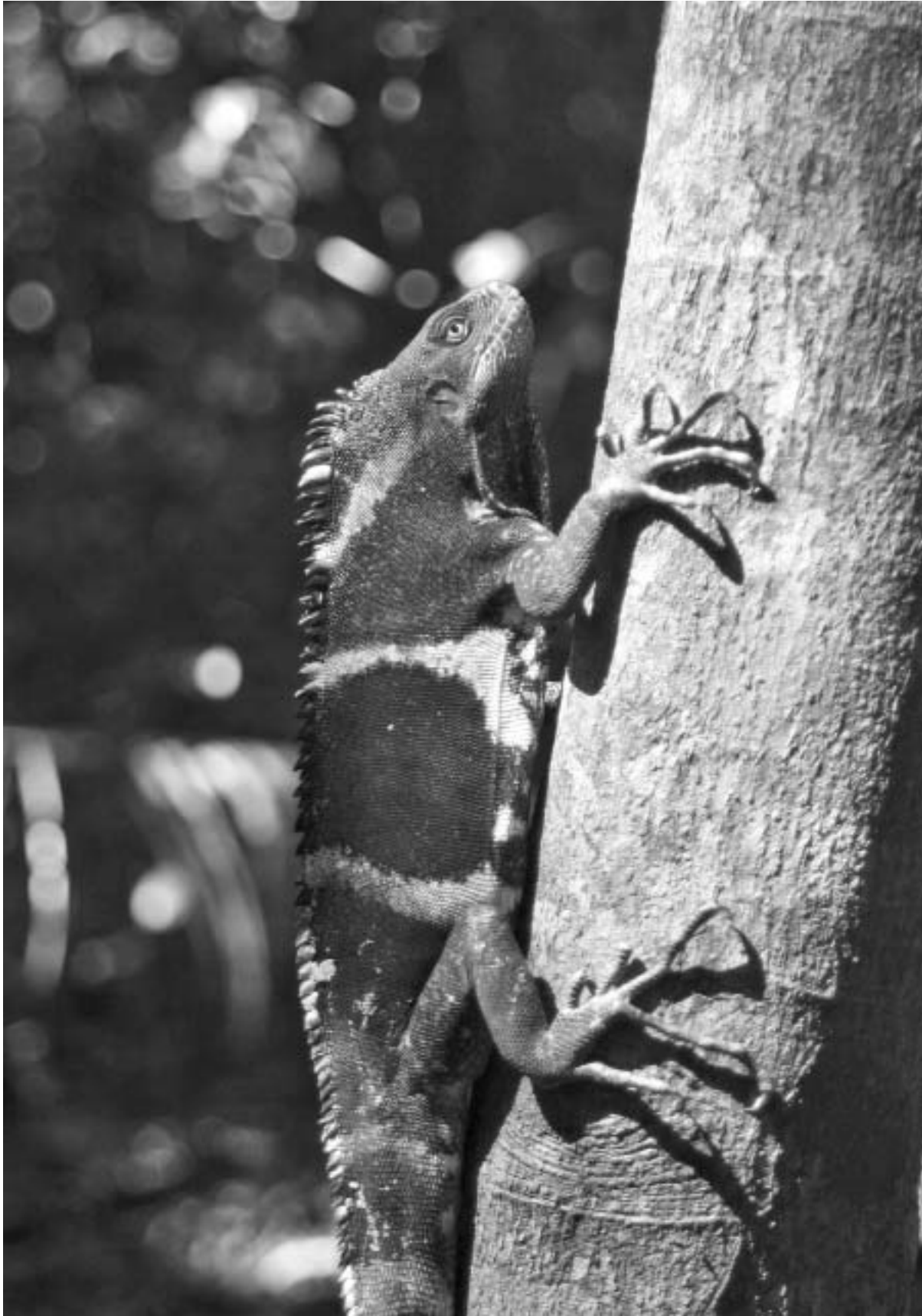
Adult Fijian Crested Iguana ( Brachylophus vitiensis ) from Yadua Taba Island, Fiji.