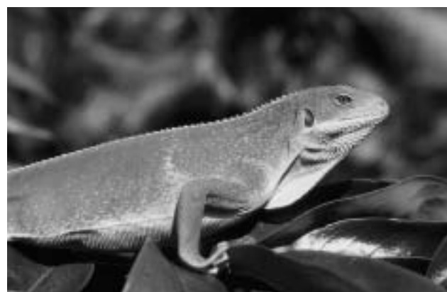
A gravid female Banded Iguana from the large inhabited island of Kadavu, where occasional sightings still occur.

Banded Iguanas are slender and often brilliant emerald green in color. Adult males have two broad, pale transverse bands across the body and several more on the tail, whereas in females these bands are usually entirely missing or only barely visible. Today, the Banded Iguana appears restricted to islands with coastal and lowland forests, but historical evidence suggests