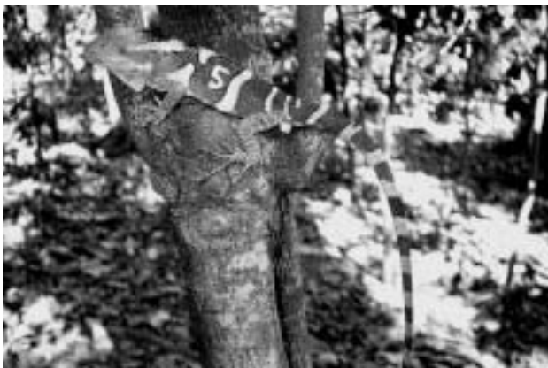
A Monuriki Crested Iguana with a temporary marking to avoid double-counting during a population census.

The Fijian Crested Iguana ( Brachylophus vitiensis ) was first brought to the attention of the herpetological world in 1981, when John Gibbons recognized this species as being very different from the smaller Pacific Banded Iguana (Gibbons 1981). Its presence had long been known to the local Fijians, and the Saumuri (Crested Iguana) is well represented in legends, stories, and village folklore on the islands where it occurs (A. Bicilio, personal communication). Despite its relatively recent scientific discovery, today we know far more about the abundance, distribution, and biology of the Crested Iguana than we do about the Banded Iguana.