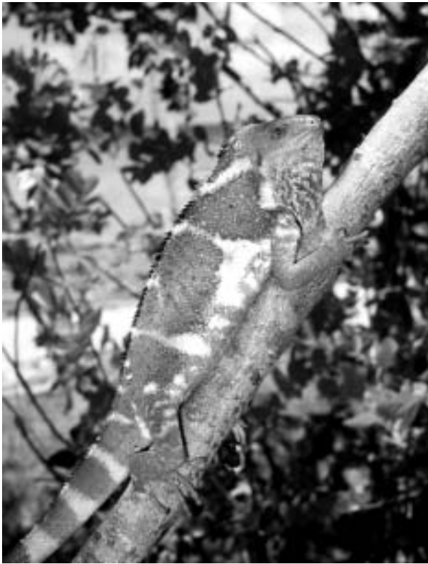
A Crested Iguana on Yadua Taba Island.

Watkins 1982). The two species do not co-occur on any island. Larger, probably more terrestrial species did occur in the recent past, but were eaten and exterminated by early human inhabitants in both Fiji ( Lapitiguana impensa ; Pregill and Worthy 2003) and Tonga ( Brachylophus gibbonsi ; Pregill and Steadman 2004).