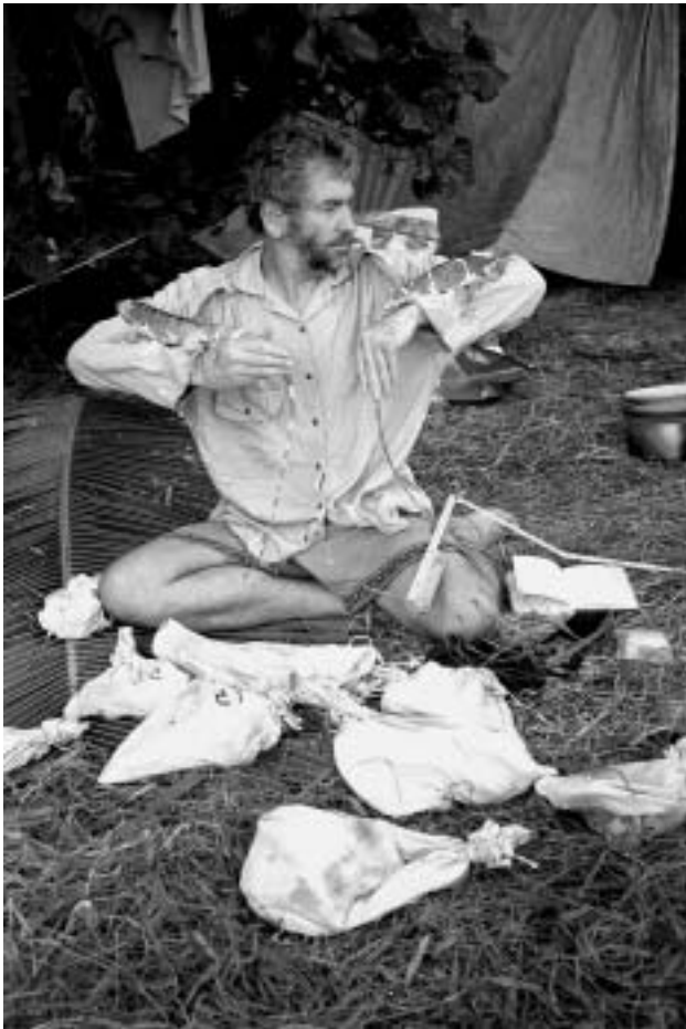
The author on Yadua Tabu with Crested Iguanas bagged for fecal collection as part of a dietary study.

ICFFCI was established in 1999 by a Memorandum of Agreement between the government department in charge of protection and conservation of Fiji's natural resources, The National Trust of the Fiji Islands, and the two recognized centers for the captive breeding of the Fijian Crested Iguana (Kula Eco Park in Sigatoka, Fiji, and Taronga Zoo in Sydney, Australia). The urgent need for this international conservation fund was perceived and its creation accomplished primarily by Carol Bach (Taronga Zoo) and Philip Felsted (Kula Eco Park). The objectives of the fund are to: Develop through education and public awareness programs a better understanding and appreciation of the Fijian Crested Iguana and its habitat; assist in the conservation of existing wild Fijian Crested Iguana populations and their natural habitat; and create, manage, fund, and maintain one or more new Crested Iguana sanctuaries in the Republic of Fiji.