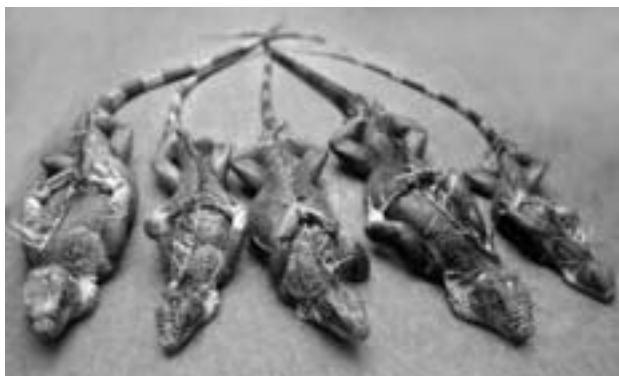
Green Iguanas still appear regularly at Central American markets.

Usually a captured specimen offers no resistance. If it is released and teased, it sometimes puts up quite a show of angry defense. Some of my men once caught and released an iguana, unknown to me. I came upon it, thinking it a wild one, and when I got close enough, it lashed out with its tail, striking me on the side of my thigh between the knee and hip. It raised a welt which lasted several hours. It also threatened to bite. I took it into a cabin and thrust a broom at it. The lizard struck at the broom with his tail, then bit at it savagely, taking off part of the straw. Another specimen, trussed up in the usual Panamanian manner, managed to get its front legs loose and bruised one of my companions arms with its tail. Wounded specimens are much more likely to fight than uninjured ones. Some natives claim they can make a good account of themselves with a small dog.