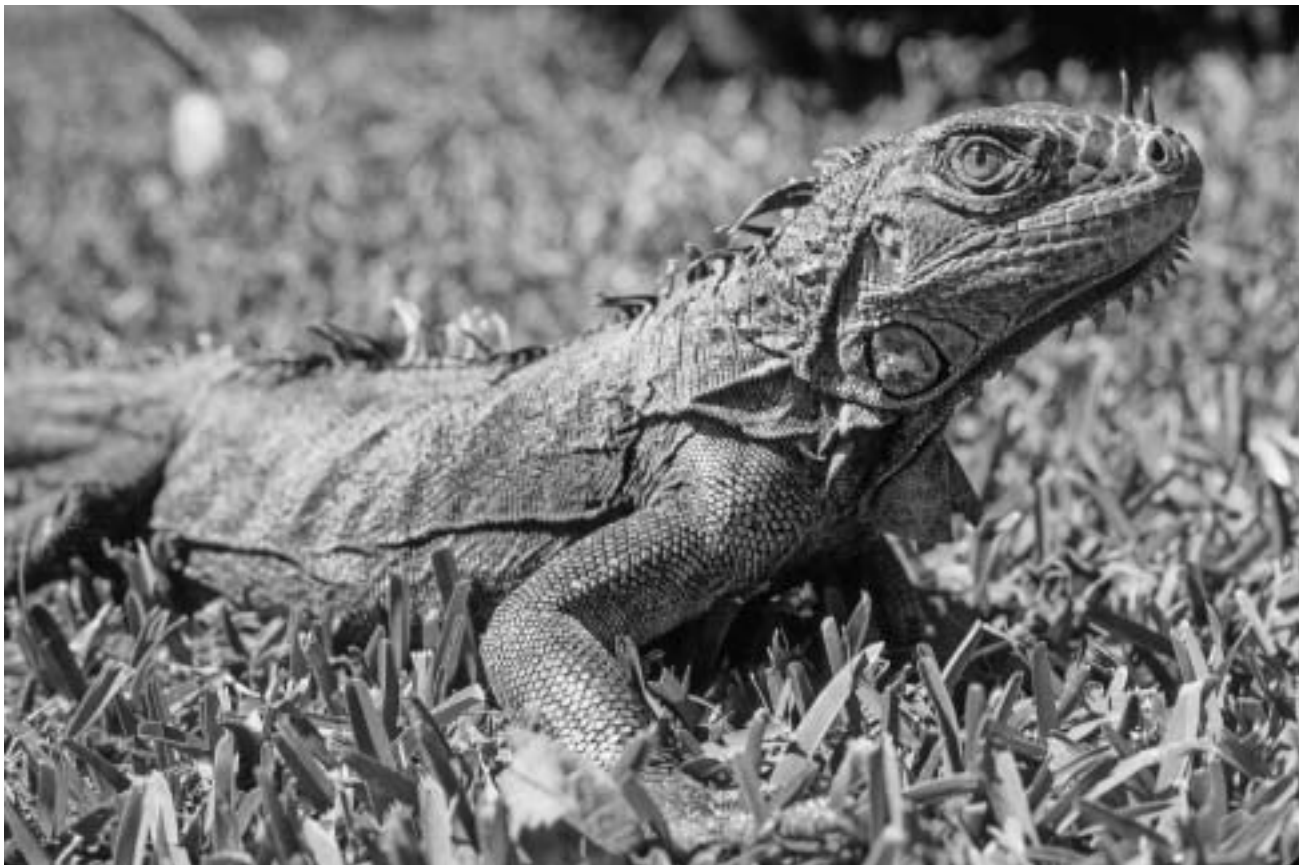
A Central American Green Iguana ( Iguana iguana).

excelsum , to mention a few. They are liable to be found on almost any tree, however, even small species like the Cecropias .