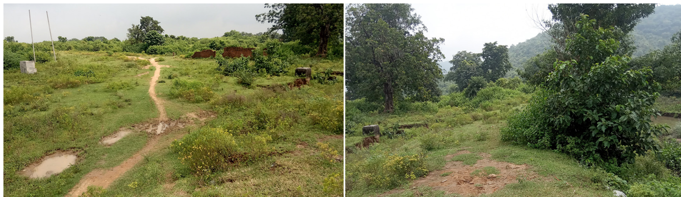
Fig. 2. Habitat near the GLA College Hostel Daltonganj, Jharkhand, India, where an Asian Painted Frog ( Kaloula pulchra ) was captured.