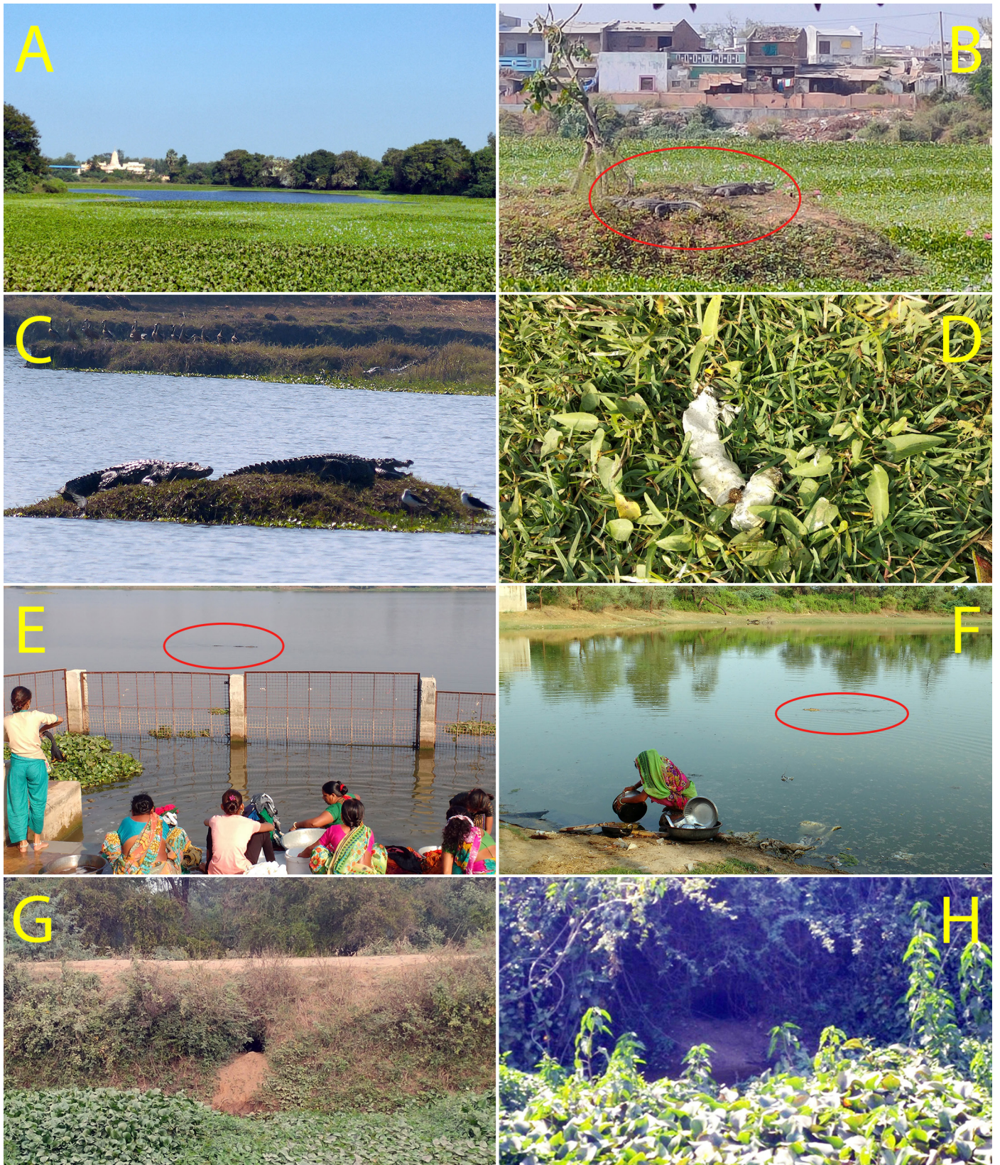
Fig. 2. The pond in Dabhau inundated with Water Hyacinths ( Eichhornia crassipes ) (A); Marsh Crocodiles ( Crocodylus palustris ) basking at the pond in Dabhau (B); crocodiles basking on a mound in Heranj (C); crocodile scat on the bank of the pond in Vaso (D); metal framework to prevent human-crocodile conflict in Deva (note the crocodile beyond the barrier) (E); human-crocodile interaction in Petli (F); a crocodile den along a road in Deva (G); crocodile den on the bank of the pond in Deva (H).