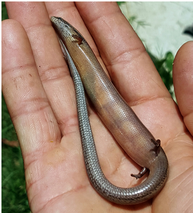
Fig. 1. A gravid female Cuban Pale-necked Galliwasp ( Diploglossus delasagra ) freshly captured near Guaracabulla, Placetas Municipality, Villa Clara Province, Cuba. Notice the fully-developed eggs visible through the skin.

In regard to the Cuban species of Diploglossus , clutch sizes of five and six eggs have been reported in D. delasagra (Barbour and Ramsden 1919; S.B. Hedges in Henderson