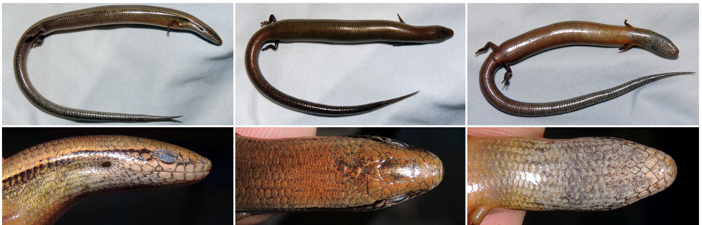
Fig. 7. A female Cuban Pale-necked Galliwasp ( Diploglossus delasagra ) shortly after death.

García (2003) noted that Cuban species of Diploglossus feed on insects and other invertebrates of the soil macrofauna, but offered no details. The Puerto Rican Galliwasp ( D. pleii ) is known to consume a variety of arthropods (insects, centipedes, millipedes) and mollusks (slugs) (Thomas and Gaa Kessler 1996). Parada Isada et al. (2010) offered spiders, ants, termites, and small mollusks to a captive female D. delasagra attending an egg clutch, but observed no feeding behavior. Apparently, feeding is incompatible with parental care in most situations, but in prey-rich environments in captivity some female anguils have been observed to continue eating during clutch attendance (Greene et al. 2006).