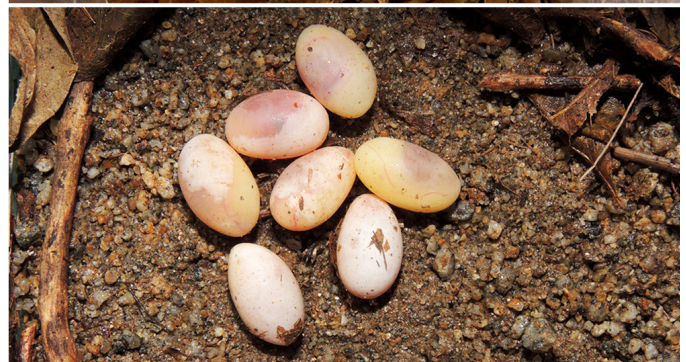
Fig. 2. A female Cuban Pale-necked Galliwasp ( Diploglossus delasagra ) in a glass terrarium after two eggs had been laid (top) and a shallow depression with seven eggs two days after oviposition (dry leaves and the lizard were momentarily removed to take the photograph) (bottom); one egg, apparently infertile, had been eaten the previous night.