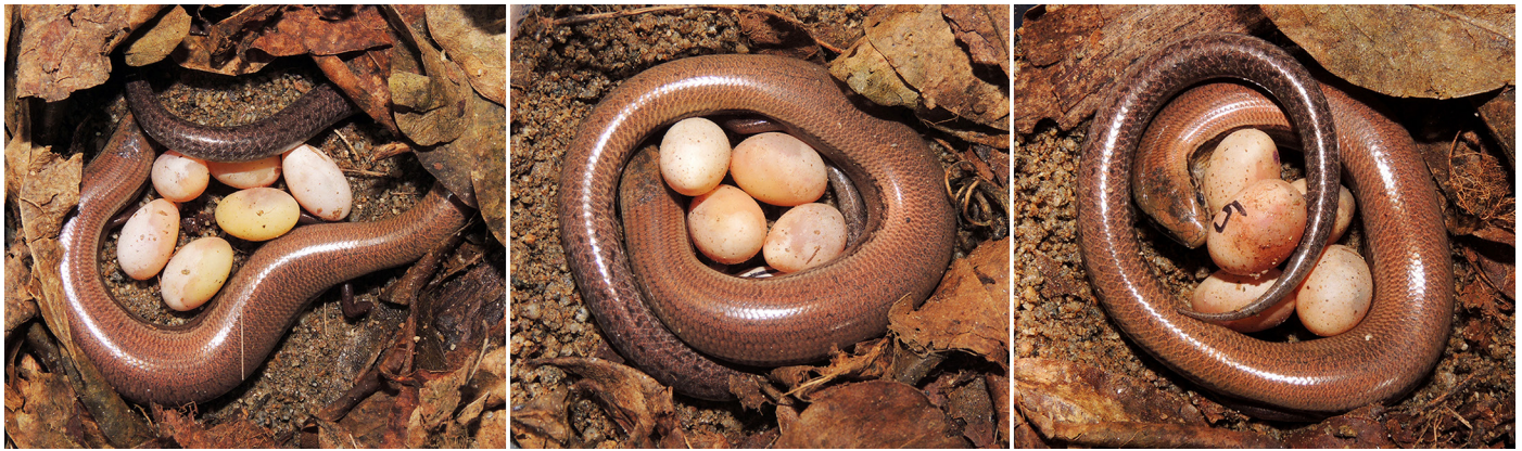
Fig. 6. A female Cuban Pale-necked Galliwasp ( Diploglossus delasagra ) curled around her clutch of eggs at various times during the incubation period.