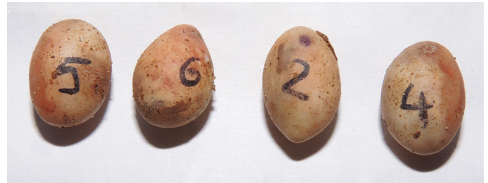
Fig. 5. Four eggs of a Cuban Pale-necked Galliwasp ( Diploglossus delasagra ) on 31 July 2016 (24 days after oviposition). Notice the more rounded shape.

Our observations also are consistent with previous reports regarding the existence of some degree of parental care, in this case egg/nest-guarding, in D. delasagra (Barbour and Ramsden 1919; P.J. Darlington in Barbour and Shreve 1937; Parada Isada et al. 2010). The female described above never reacted aggressively when disturbed and limited activity to the immediate vicinity of her eggs. Parada Isada et al. (2010) also noted that the female they described never displayed any aggressive behavior and remained indifferent to stimuli such as a camera flash and handling of the container and substrate. Savage (2002) noted similar observations of a female O’Shaughnessy’s Galliwasp ( D. bilobatus ) in Costa Rica. However, a female Rainbow Galliwasp ( D. monotropis ) attending a clutch in captivity assumed an open-mouthed threatening posture when disturbed (Solórzano 2001). Guarding behavior in D. delasagra and probably at least some other congeners (Greene et al. 2006) seems to be limited to protecting the eggs from predation by arthropods or small ver-