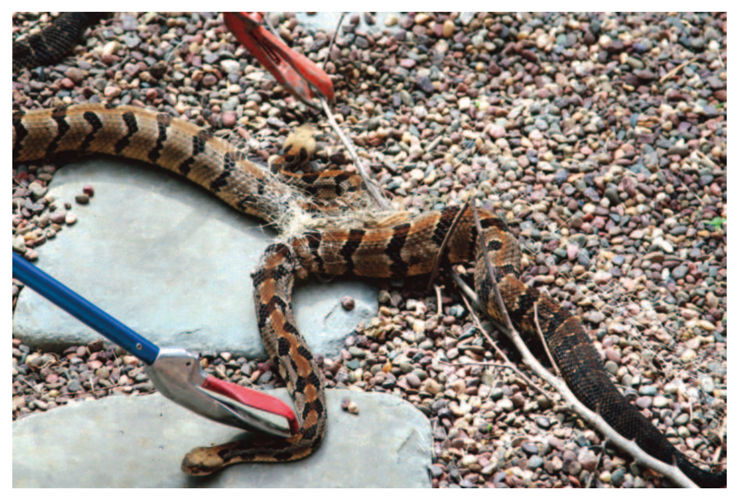
Fig. 1. Male and female Timber Rattlesnakes ( Crotalus horridus ) entangled in landscaping fabric, July 2009 at a private residence in Lenexa, Kansas. These snakes (transmitter frequencies 105, 515, respectively) were subsequently relocated and their movements tracked by radiotelemetry.

A change in the development plan spared the original den site, which remains part of a Lenexa city park. Not all Timber Rattlesnakes utilizing that den had been captured during the original relocation effort, and periodically some snakes caused public alarm by utilizing habitat around homes. On 22