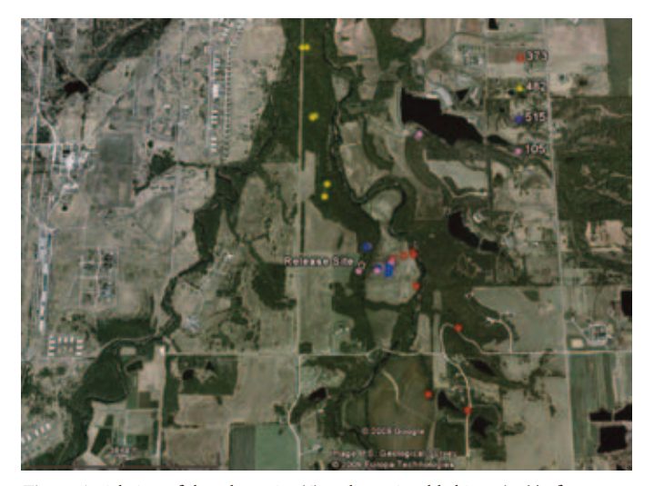
Fig. 2. Aerial view of the release site ( \P ) and associated habitats (3,648 ft = 1,112 m). Each snake's periodic location (per telemetry) and habitat use (2009 season) is indicated by a different color.

The mating system of C. horridus has been described as prolonged mate-search polygyny (Brown 1995), a system in which males out-compete one another in their efforts to find, court, and copulate with spatially dispersed females during a prolonged, late-summer mating season (Duvall et al.