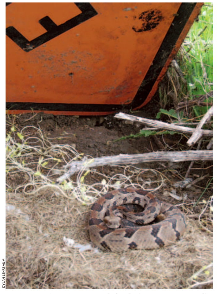
Fig. 4. Some Timber Rattlesnakes ( Crotalus horridus ) demonstrate an apparent affinity for anthropogenic habitats. This male was found beneath a construction sign.

Taken together and applied to the foraging behavior of female-515 and male-105, these observations suggest that adult C. horridus might be behaviorally as well as phenotypically plastic (e.g., Jenkins et al. 2009), and that some individuals might be very tolerant of (or even show affinity for) nearby human activity (Fig. 4) and disturbance if abundant prey are associated with anthropogenic habitats (gardens, buildings, etc.). Unfortunately, this tolerance is seldom extended in reverse. Although a strong affinity for buildings is atypical of Timber Rattlesnakes generally, given their widespread geographic overlap with humans (Brown 1993, Walker et al. 2009), their cryptic and generally secretive nature (Brown 1993, Furman 2007),