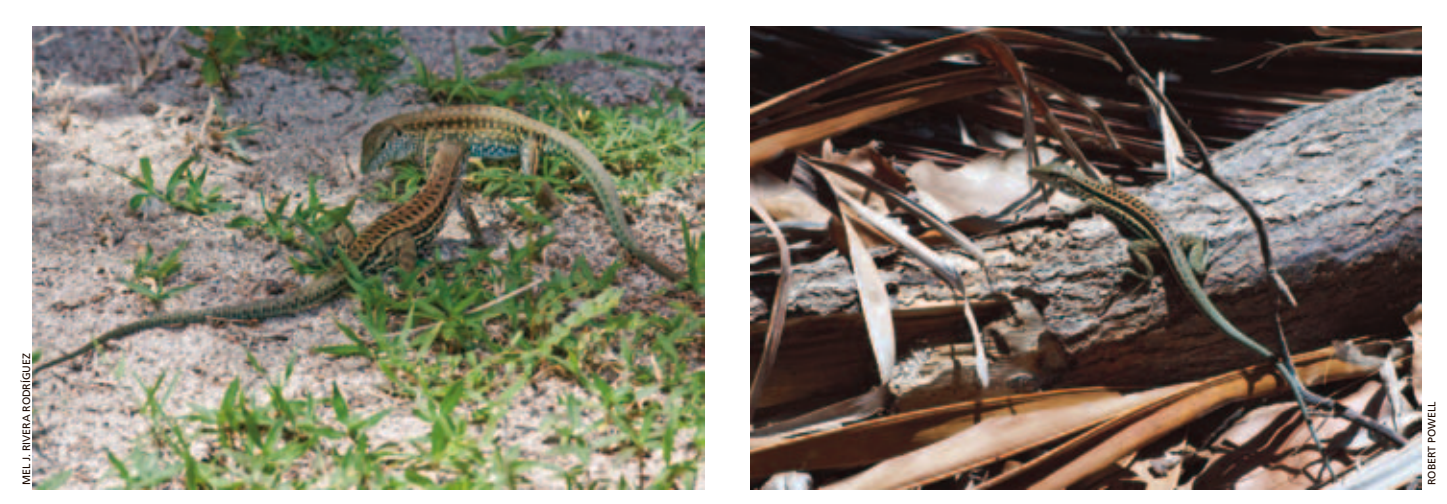
To escape predators, the Ground Lizard ( Ameiva ameiva ) will bipedal and can reach peak speeds approaching 300 cm/sec. Adults (left) are not territorial and frequently forage in close proximity to one another, although fights and chases occasionally ensue when paths converge. Juveniles (right) have a distinct striped pattern, which blends well with surroundings as individuals move through grass or open vegetation.

with which they are sometimes confused. However, skinks are substantially larger (maximum SVL = 87 mm for males and 93 mm females; Schwartz and Henderson 1991). Exclusively diurnal, with an activity peak at midday (Rocha et al. 2009), these active foragers feed mostly on insects and wood lice (Malhotra and Thorpe 1999).