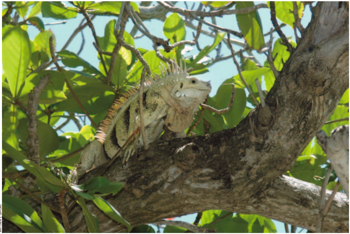
Although not as large as conspecifics on some other islands, Green Iguanas ( Iguana iguana ) are the largest reptiles on Union. These bulky lizards are diurnal but were frequently seen at night sleeping in tree canopies.

Union. Anolis aeneus is predominantly insectivorous, but larger individuals on Grenada engage in herbivory (Schoener and Gorman 1968). Ground color varies from dark gray to green and pale tan, and some individuals have spots and/or dorsolateral stripes. Males have a bright yellow dewlap. Males especially are approachable, do not frighten easily, and will perform push-ups, dewlap extensions, and head-bobbing, all considered signs of territoriality (Stamps and Barlow 1972), when approached by people. When disturbed, however, these lizards tend to "squirrel" around to the opposite side of their perch, but eventually move upward, often to the highest branches of a tree.