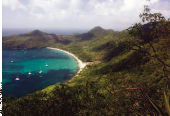
Critical habitat is provided by the old secondary forests in the area above Chatham Bay, on the northwestern slope of Mt. Taboi. Clearings for agricultural or residential purposes are evident near the far (northern) end of the area and a resort, currently servicing the yachts that anchor in the bay, can be seen expanding up the slope.