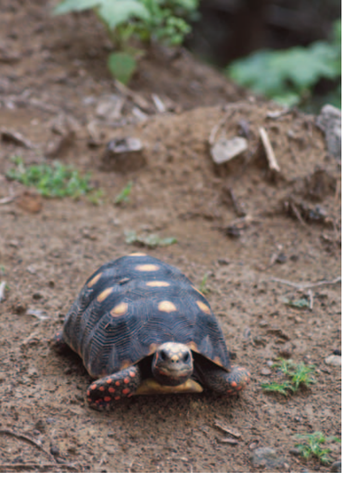
Although Red-footed Tortoises ( Chelonoidis carbonaria ) are utilized as a food resource throughout much of their range (Farias et al. 2007), Union islanders shun the consumption of Red-footed Tortoises because of their indiscriminate diet that can include carrion and feces (Daudin and de Silva 2007).

Hemidactylus mabouia (Moreau de Jonnés 1818). Family Gekkonidae. Local name: Wood Slave. English common name: Tropical House Gecko.