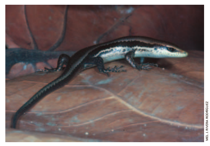
The Lesser Antillean Skink ( Mabuya mabouya ) is primarily terrestrial; however, it will readily climb trees, boulders, and buildings to bask or forage.

of West Indian populations currently assigned to the genus Mabuya is poorly resolved, and populations on each island bank should be considered endemic to that bank until detailed studies have been conducted. Skinks are rare on all islands save Dominica (Malhotra et al. 2007). Antillean skinks usually are associated with tropical dry scrub and arid regions (e.g., Rivero 1978). Although primarily terrestrial, they readily climb into high vegetation or even on buildings. With a bronze ground color and a dark lateral stripe, skinks superficially resemble Gymnophthalmus underwoodi ,