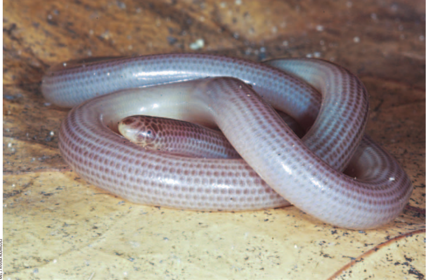
MFL L RIVERA ROD