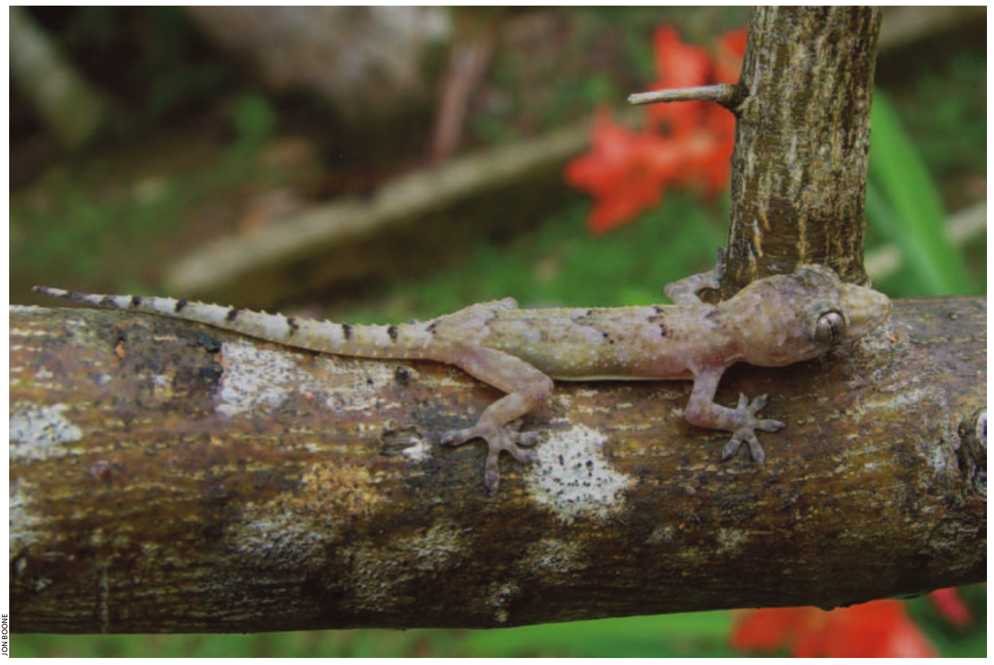
Native to Sub-Saharan Africa but widely distributed in mainland South America, Hemidactylus mabouia might have arrived in the West Indies either by natural over-water dispersal or as a hitchhiker with Amerindians (Jesus et al. 2001). These geckos thrive in disturbed areas that include human structures and dwellings (e.g., Ávila-Pires 1995, Vanzolini 1968).

does not reside, T. rapicauda tends to be edificarian (found on and in buildings) as well (Vitt and Zani 1997). Most activity occurs before midnight (Germano et al. 2003, Vitt and Zani 1997). Primarily insectivorous, T. rapicauda is an ambush forager (Cooper 1994, Cooper et al. 1999). Studies of other sympatric geckos species have found high rates of spatial competition on man-made structures (Case and Bolger 1991). Although known to co-occur on buildings on other Antillean islands (e.g., Howard et al. 2001,