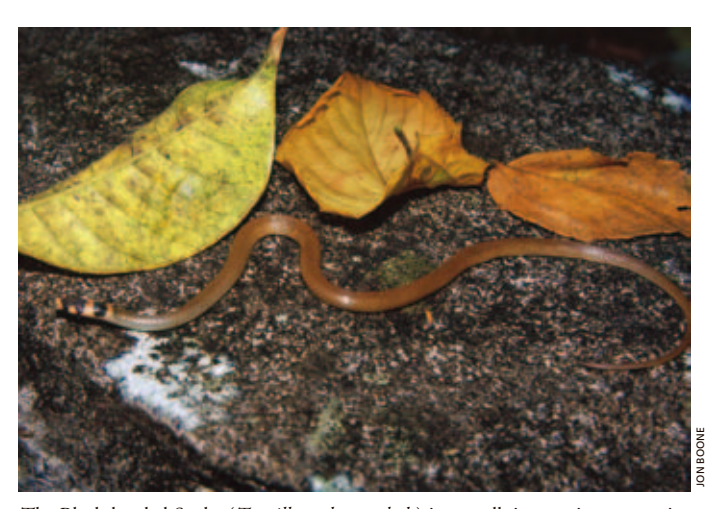
The Black-headed Snake ( Tantilla melanocephala ) is a small, inconspicuous species only recently introduced onto islands of the Grenada Bank.