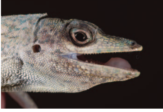
The Grenada Bush Anole ( Anolis aeneus ) is ubiquitous throughout Union, and the most commonly encountered species on the island. Found on trees, deadfall and other debris, and man-made structures such as fences and buildings, this arboreal lizard is not timid, and is known to direct territorial displays toward humans who venture too close.

Anolis aeneus (Gray 1840). Family Polychrotidae. Local name: Tree Lizard. English common name: Grenada Bush Anole. Endemic to the Grenada Bank, the largest individual recorded (SVL = 73 mm) on Union was slightly smaller than the maximum size of individuals from Grenada (SVL = 77 mm; D. Crews in Stamps 1977) and an introduced population in Guyana (SVL = 80 mm; Lazell 1972). Tolerant of both xerophilic and mesophilic conditions (Schwartz and Henderson 1991), these lizards are active from dawn to dusk and are ubiquitous in natural and human-altered habitats on