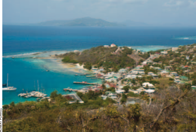
Clifton Harbor is the largest town on Union Island. Carriacou, one of the Grenada Grenadines is visible in the distance.