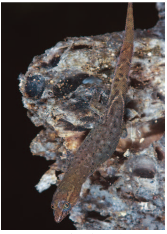
The Grenadine Sphaero ( Sphaerodactylus kirbyi ) is the smallest reptile on Union, weighing an average 0.3 g.

concentric red rings on a dark green ground color (Powell and Henderson 2005), these little lizards appear to have been decorated for the holidays. Apparently crepuscular, G. daudini seems to cease activity when ambient air temperatures exceed those under boulders and logs or in the crevices of rock outcroppings where geckos seek shelter during the day. The slopes above Chatham Bay provide the only habitat where a population is known to exist.