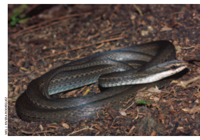
The White Snake ( Mastigodryas brusei ) is the only one of Union's snake species that is active and frequently encountered during the day.

Tantilla melanocephala (Linnaeus 1758). Family Colubridae. Local name: unknown. English common name: Black-headed Snake. Native to the Neotropical mainland, Trinidad, and Tobago and introduced on Union