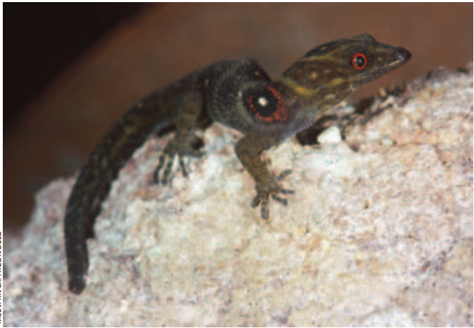
Known to occur only on the slopes above Union's Chatham Bay, the Union Island Gecko ( Gonatodes daudini ) could be driven to extinction if proposed plans for developing the bay area are implemented (Daudin and de Silva 2007).

concentric red rings on a dark green ground color (Powell and Henderson 2005), these little lizards appear to have been decorated for the holidays. Apparently crepuscular, G. daudini seems to cease activity when ambient air temperatures exceed those under boulders and logs or in the crevices of rock outcroppings where geckos seek shelter during the day. The slopes above Chatham Bay provide the only habitat where a population is known to exist.