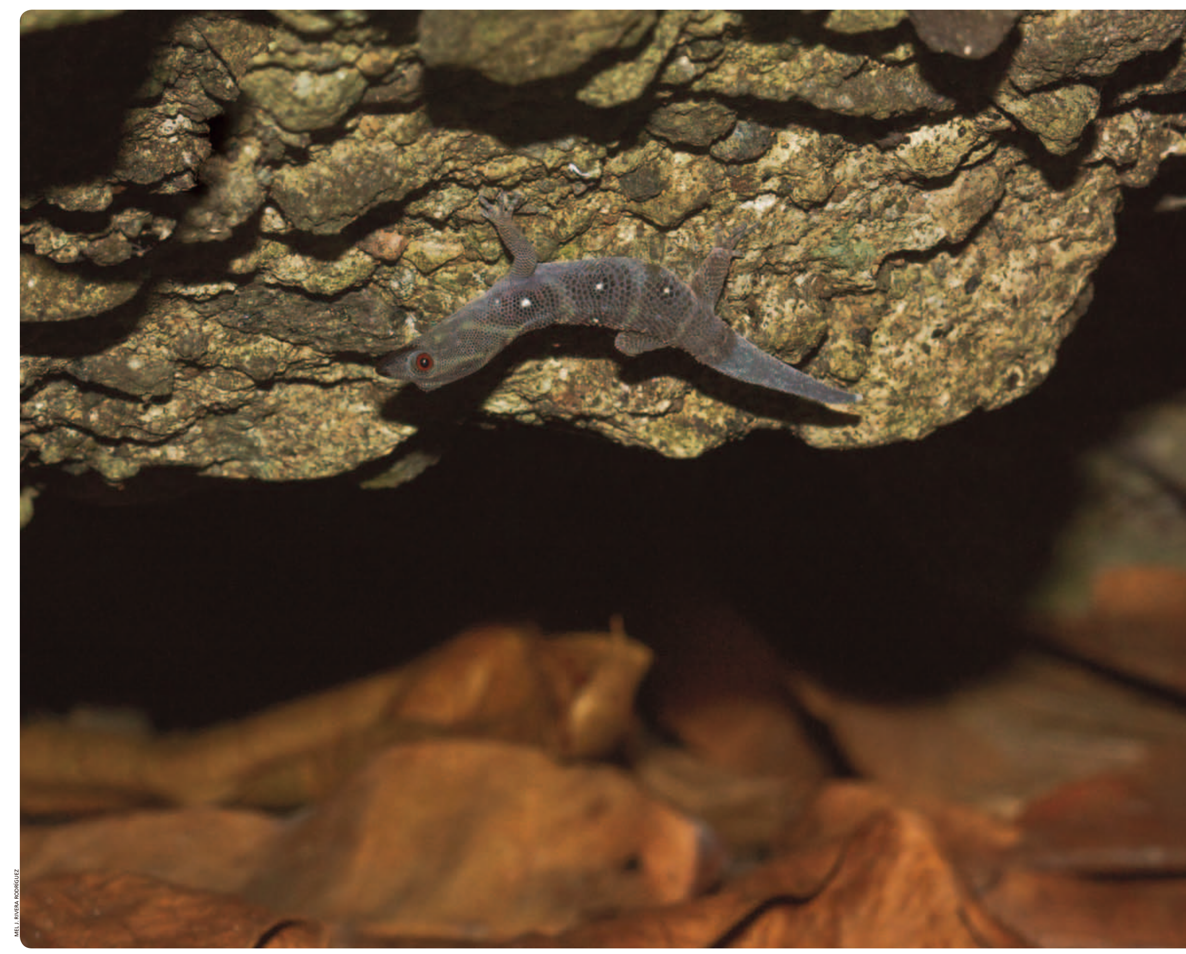
The most frequently observed posture of Union Island Geckos (Gonatodes daudini) is hanging upside-down in a rock crevice above dense leaf litter.