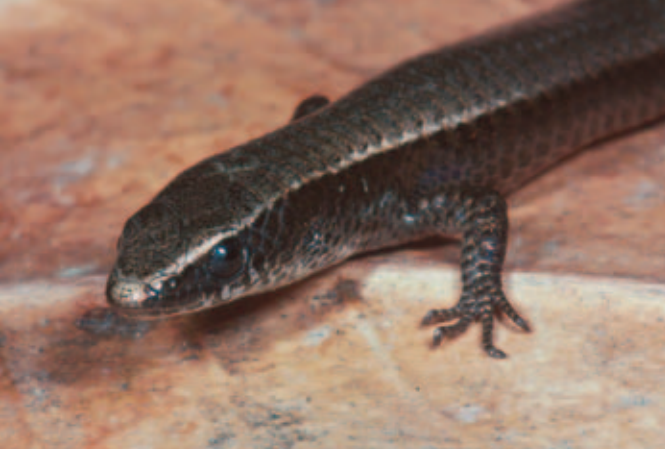
Often confused with skinks, Smooth-scaled Worm Lizards ( Gymnophthalmus underwoodi ) are substantially smaller, with a maximum head-and-body length of less than 5 cm.

Bachia heteropa alleni (Barbour 1914). Family Gymnophthalmidae. Local name: Unknown. English common name: Earless Worm Lizard. This Neotropical endemic occurs on the South American mainland, Trinidad, Tobago, and the Grenada Bank (Dixon 1973, Henderson and Powell