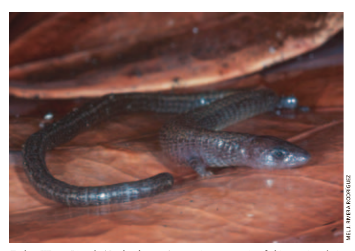
Earless Worm Lizards ( Bachia heteropa ) move in a serpentine fashion, using their long tails for locomotion when on the surface; their reduced legs might serve as anchors when burrowing underground.