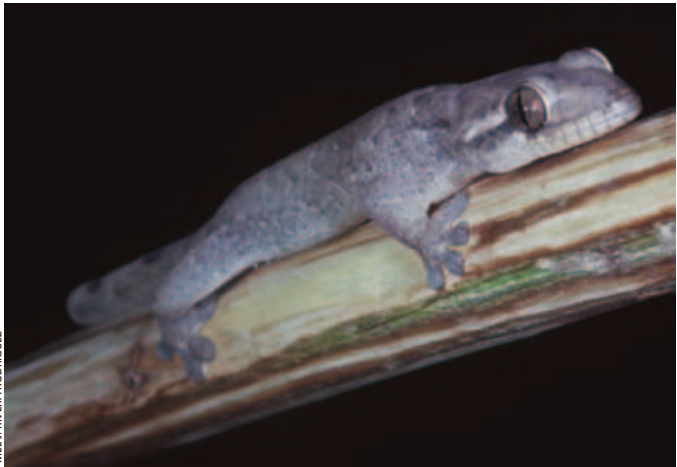
The Turnip-tailed Gecko ( Thecadactylus rapicauda ) is frequently confused with the Woodslave ( Hemidactylus mabouia ), although its large, swollen regenerated tail and sheathed claws readily distinguish the two.

does not reside, T. rapicauda tends to be edificarian (found on and in buildings) as well (Vitt and Zani 1997). Most activity occurs before midnight (Germano et al. 2003, Vitt and Zani 1997). Primarily insectivorous, T. rapicauda is an ambush forager (Cooper 1994, Cooper et al. 1999). Studies of other sympatric geckos species have found high rates of spatial competition on man-made structures (Case and Bolger 1991). Although known to co-occur on buildings on other Antillean islands (e.g., Howard et al. 2001,