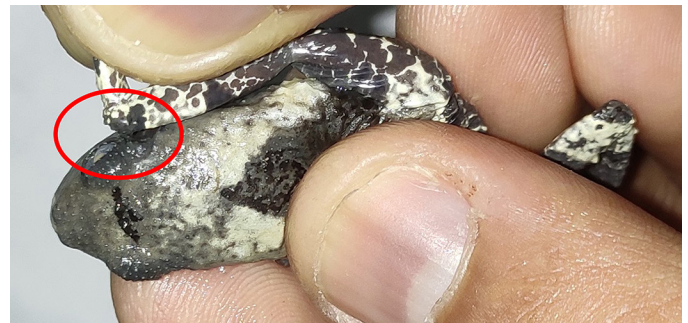
Fig. 3. Tibiotarsal articulation reaching the eye in a Baibung Small Treefrog ( Theloderma baibungensis ).

The ML phylogenetic reconstruction (Fig. 4) clearly placed T. baibungense (OK474164–6) with T. baibungense (KU981089) from China by a well-supported node (bootstrap = 100), formed a distinct clade with respect to congeners, and was strongly clustered in a single clade deeply nested in the Theloderma clade. The genetic divergence (K2P) between our samples ( T. baibungense ) and type material from Tibet (China) was 1.00%, whereas the average interspecific K2P genetic distance was 10% (Table 2), confirming the presence of T. baibungense in Mizoram.