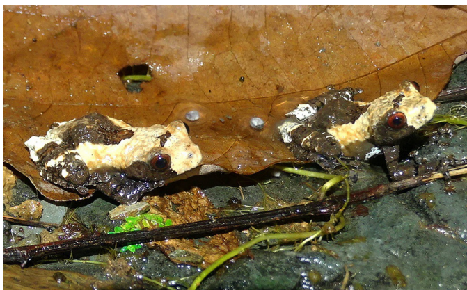
Fig. 1. Baibung Small Treefrogs ( Theلودerma baibungense ) from Mizoram, India.

The genus Theلودerma Tschudi 1838 (Bug-eyed Treefrogs) comprises 26 currently recognized species that are distributed in northeastern India, Myanmar, southern China, and throughout southeastern Asia (Frost 2021). Information on these frogs is very limited and species delineation for this group is quite challenging, largely due to morphological similarity but also because many species are poorly represented in museum collections, with some known only from a single or a few sampling sites (Nguyen et al. 2014, 2016). The Baibung Small Treefrog ( Theلودerma baibungense ) is known from the type locality in Beibung, Medog County, Tibet, China, to northeastern India (Arunachal Pradesh, Assam, and Nagaland) and northeastern Bangladesh (Lawachara National Park) (Frost 2021). Members of the T. asperum species complex from southern Asia have been identified as either T.