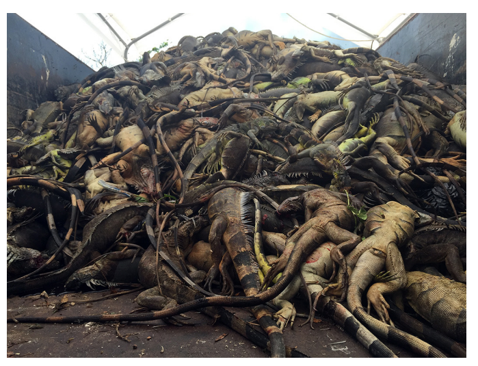
Fig. 4. A pile of Common Green Iguanas ( Iguana iguana ), culled during an attempt to control their spread on Grand Cayman, clearly shows the magnitude of the invasion.

Perhaps detection using drones (e.g., Aota et al. 2021), possibly even application of control measures (e.g., Song et al. 2020) will eventually offer an effective and rapid response methodology. However, as important as they are in addressing novel invasions (Reaser et al. 2019), rapid detection and response are reactive approaches. The Florida Fish and Wildlife Conservation Commission is set to proactively ban the breeding and trade in ecologically damaging invasive herps, including several constrictors, all tegus and some monitors, and Common Green Iguanas (Florida Fish and Wildlife Conservation Commission 2021). Of course, with these species already established in many locations and chances of eradication unclear, this may be a case of closing the terrarium door after the iguanas have bolted. Experience has shown that pre-invasion, proactive prevention is more effective than post-invasion control efforts, although remarkable progress in eradication of invasives, primarily small mammals on small islands, has been seen in recent years (Capizzi 2020). Prevention requires not only policy-maker engagement, but first and foremost, public support (Perry et al.