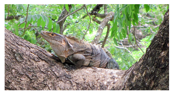
Fig. 3. An adult Common Spiny-tailed Iguana ( Ctenosaura similis ) in northern Costa Rica, where they are native. The species inhabits a wide range of habitats and is often seen near human habitations.

ting coverage in the popular media, ranging from local press (Kay and Associated Press 2017) to international news (e.g., Knight 2020). However, these stories generally focus on the nuisance created by invasive iguanas, rather than the more complex situations that professional conservation biologists are documenting and attempting to address. For example, van den Burg et al. (2020) discussed damage to infrastructure, agricultural losses and other economic impacts, and threats to biodiversity caused by the spread of Common Green Iguanas in mainland Asia. Further, Moss et al. (2018) reported the alarming intergeneric hybridization with endangered native iguanas in the Caribbean. Interbreeding is a relatively common outcome of human-caused species invasions (Ottenburghs 2021). These and other devastating impacts are commonly the result of invasive species in general but often remain unnoticed by the public until the damages reach large scales (e.g., Pyšek et al. 2020). Knapp et al. (2020) and others have documented the impacts of invasive iguanas on ecosystems. These include altering seed dispersal patterns, enabling secondary invasions by parasites, and more. James Lazell (pers. comm.) often worried about dispersing Common Green Iguanas in the British Virgin Islands dominating habitats that the native Stout Iguanas (Cyclura pinguis) could use as part of a restoration effort.