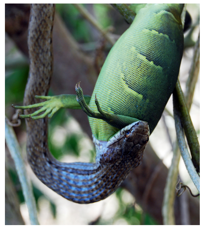
Fig. 2. A local Puerto Rican Racer ( Borikenophis portoricensis ) feeding on a juvenile Common Green Iguana ( Iguana iguana ) introduced to Tortola, British Virgin Islands.

As with many other invasive species, the impacts of invasive iguanas are especially large on island ecosystems (IUCN SSC Iguana Specialist Group 2017). Although other lizards such as tegus and monitors can be problematic in places like Florida, Common Green Iguanas stand out because of the scale of their spread and reported impacts (Perry et al. 2020a). Indeed, Common Green Iguana invasions have been get-