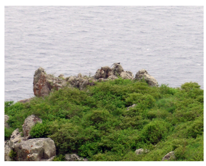
Fig. 1. A Common Green Iguana ( Iguana iguana ) (on rock, center) on Saba, Caribbean Netherlands. The iguanas are common in some habitats on the island, but whether they are native or introduced, and if so when and by whom, is unclear (Powell et al. 2005).

Compared to fictional voracious cinematic sharks or the very real crises of climate change and COVID-19, the genuine threat of Common Green Iguanas ( Iguana iguana ; Figs. 1–2) and Spiny-tailed Iguanas ( Ctenosaura similis and C. pectinata ; Fig. 3) seems quite innocuous. Originating in the Neotropics, they are at risk in parts of their native range because their habitats are being degraded and animals are captured for human consumption. Being intentionally moved, primarily via the pet trade, and unintentionally hitchhiking with horticultural and construction materials has allowed these lizards to spread widely, especially Common Green Iguanas. Knapp et al. (2020) discussed the dismaying establishment of non-native iguanas in more than 25 countries.