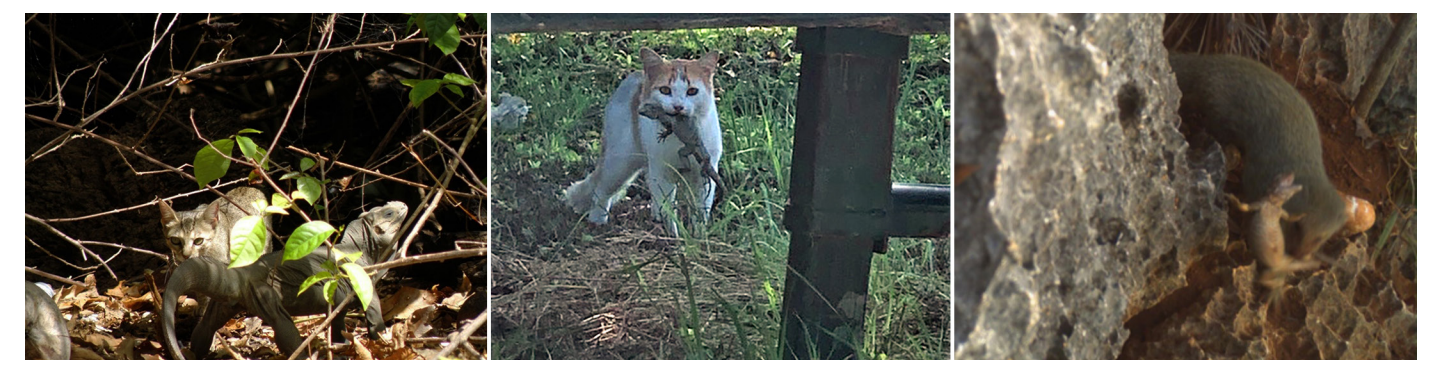
Fig. 5. A feral cat ( Felis catus ) threatens a Mona Rock Iguana ( Cyclura stejnegeri ), which has assumed a defensive position (left). An adult iguana is safe from this invasive predator, but feral cats readily consume hatchlings of all iguana species, as shown by this feral cat carrying a juvenile rock iguana it killed on Little Cayman (center). Even at low concentrations, the feral cat population makes a significant impact on the survival of hatchling and juvenile Sister Isles Rock Iguanas ( Cyclura nubila caymanensis ). Mongooses ( Urva auropunctata ) have been introduced to many Caribbean islands and are voracious predators with broad conservation impacts. In this camera-trap image, taken in Jamaica in August 2019, a mongoose is taking a hatchling Jamaican Iguana ( Cyclura collei ) from a nest in a rock crevice (right).

2020b). For example, recent public engagement and mobilization on Little Cayman, following government and partnership initiatives, resulted in a rapid response to sightings and an enhanced chance of controlling the spread of Common Green Iguanas (Knapp et al. 2020). Such public support can only be obtained where objections by animal rights enthusiasts, those with a strong financial interest, and invasion denialists (Russell and Blackburn 2017) are effectively addressed. However, different stakeholders hold diverse views and beliefs on a range of issues. For example, residents of Little Cayman supported efforts to control Common Green Iguanas but objected to killing feral cats that threaten native species (Knapp et al. 2020). To effectively protect unique native iguanas, a range of approaches is required.