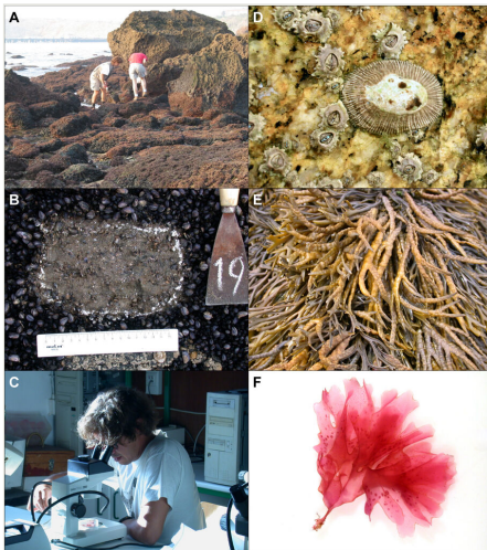
Figure 3. doi

A - A team of two people performing the SACFOR survey at Martinhal, B - Substrate scraping in a mussel bed, C - Identification of species in the lab under a stereomicroscope, D - Siphonaria pectinata , an invasive warm-water species amongst Chthamalus montagui in a tide pool, E - Pelvetia canaliculata , a cold-water species with its southern distribution limit at Cabo do Mundo, F - The red algae Nitophyllum punctatum as seen under a stereomicroscope.