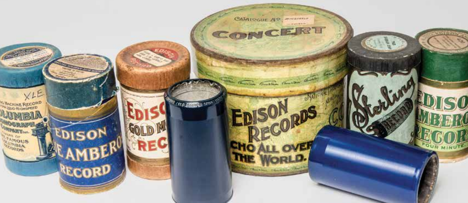
Photo of cylinders from the Belfer Audio Laboratory and Archive