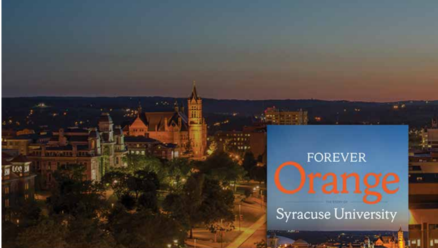
University landscape photograph