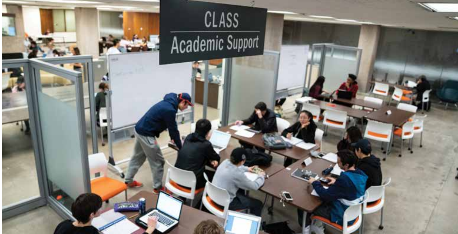
Center for Learning and Student Success (CLASS), Bird Library, Lower Level