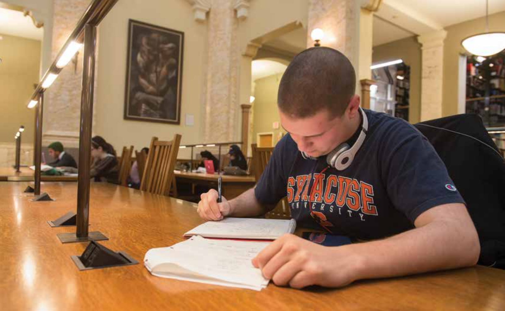
Student in Carnegie Library Reading Room