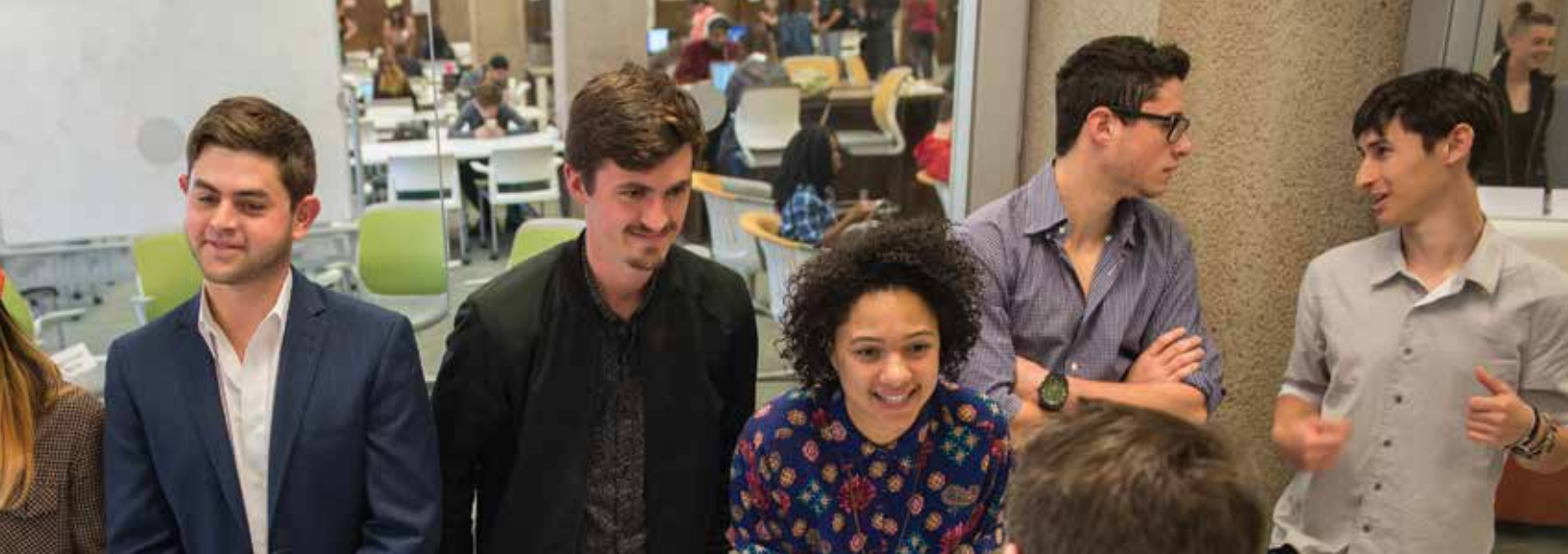
Blackstone LaunchPad Powered by Techstars, Bird Library, 1st Floor

University partners like the Whitman School of Management’s Falcone Center for Entrepreneurship, Couri Hatchery, WISE Women’s Business Center, South Side Innovation Center, the Newhouse Center for Digital Media Entrepreneurship, the Syracuse Center of Excellence, the Innovation Law Center—NYS Science & Technology Law Center, and Invent@SU, among many others.