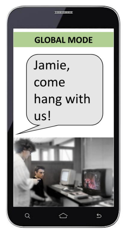
Fig. 2 Mockup of a Phone App that illustrates the implementation of the global filter for use by those wanting support with global salience. The phone interface shows a filtered image, a banner that states "global filter" to indicate the picture has been filtered and a text box that mimics social networking apps for chatting with friends. This figure is not covered by the Creative Commons Attribution 4.0 International License.

global filter to drive visual attention to global areas of images, video, and the real world<sup>1,2,3,4</sup>.