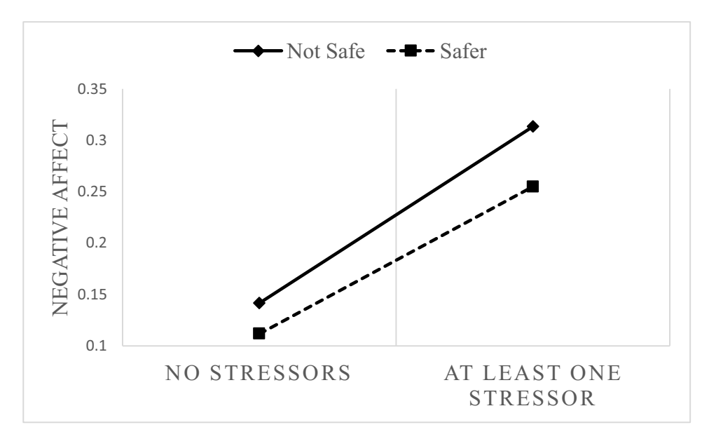
Fig. 1. Neighborhood safety x stressor interaction in relation to negative affect among midlife and older adults. A dichotomous perceived neighborhood safety variable was constructed for visualization purposes only, where individuals providing the highest rating of neighborhood safety (a value of 4 on a 1-4 scale) were coded as Safe, and all others were coded as Not Safe, given the strong skewness of neighborhood safety Figure adjusted for race/ethnicity, individual education, sex, age, levels of neuroticism, neighborhood income, mean number of stressors over the diary period, weekday versus weekend day, and chronic stressors in childhood, adulthood, and over the lifespan as well as interactions between these sources of chronic stress and self-reported daily stressors.

Neighborhood Perceptions. Neighborhood safety concerns do not represent a derived variable, nor does it summarize the characteristics of a group of people living in the same neighborhood, such as the case with neighborhood socioeconomic status. (Diez Roux, 2003) Instead, these perceptions represent a rating of the neighborhood context, albeit from the viewpoint of the residents, and therefore subjective in nature. (Diez Roux and Mair, 2010) Some researchers argue that assessments of neighborhood safety require the perspectives of local residents, and direct observation is not necessary or even appropriate. Residents spend a more significant amount of time in their respective neighborhoods than do researchers who make brief observations, and the most pernicious cues of disorder or threats of harm likely appear after dark