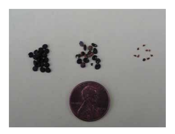
Figure 3. Normal seed (left), predated seed (center) and unfertilized ovules and aborted seed (right) of groundplum milk-vetch from the Grand River National Grassland.