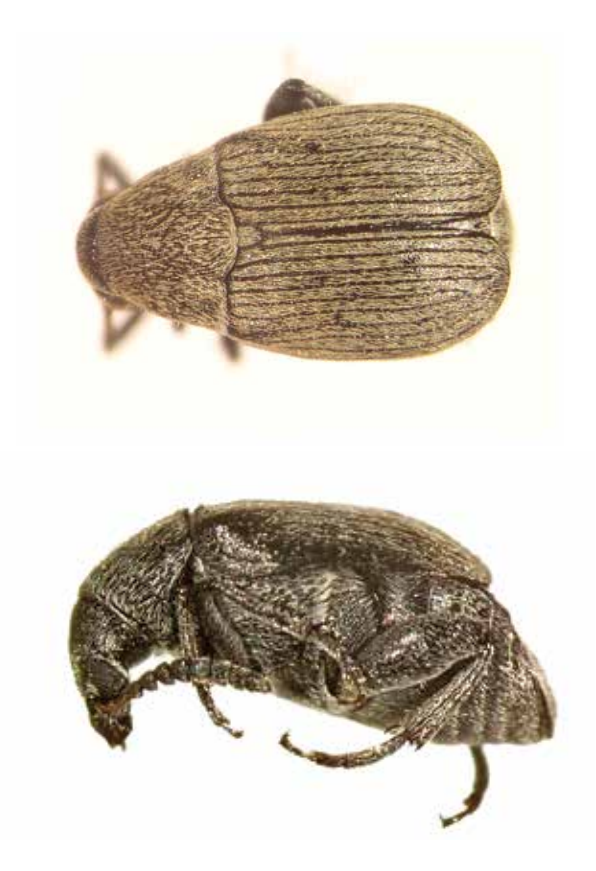
Figure 4. Acanthoscelides fraterculus; top dorsal habitus, lower lateral habitus.