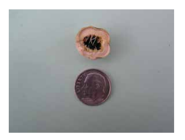
Figure 2. Placentae attached to the ovary wall with ovules extending into the locule of the valve for the pod of groundplum milk-vetch from the Grand River National Grassland.