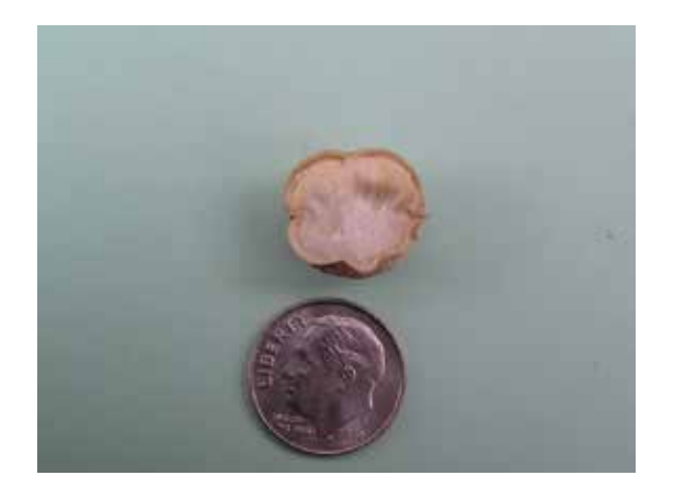
Figure 1. Individual valve of pod from Grand River National Grassland; endocarp (i.e., septum) covering the locule is adnate for about 2/3 of the inner margin.

Chi-squared analysis was used to determine if frequencies of occurrence of the four ovule-fate categories were independent of population. Analyses of variance were conducted to determine the relative importance of among population, among pods within populations, and between valves within pods within population for sources of variation for explaining variation for of each of the four ovule-fate categories (i.e., normal seed, aborted seed, predated seed, and unfertilized ovule).