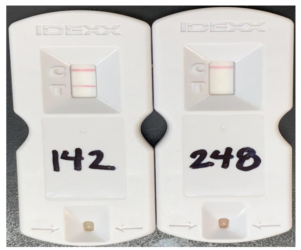
Figure 1. Alertys Ruminant OnFarm Pregnancy Test (Lateral Flow). Test on the left is a test result for a pregnant female, while the test on the right is a test result for a nonpregnant female. There should always be a control line visible indicated by the "C", unless the test is defective, which in that case rerun that sample on a new test. If a line is visible on the test line indicated by a "T" then the female is pregnant, while no visible line then the female is nonpregnant.