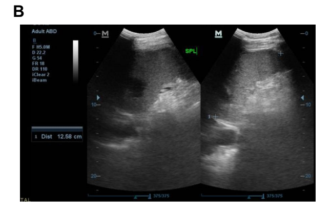
Figure I (A) Abdominal ultrasound showing hypoechoic nodular cystic area measuring 2.91 cm × 1.62 cm. (B) Indicating splenomegaly, spleen measured 12.58 cm.