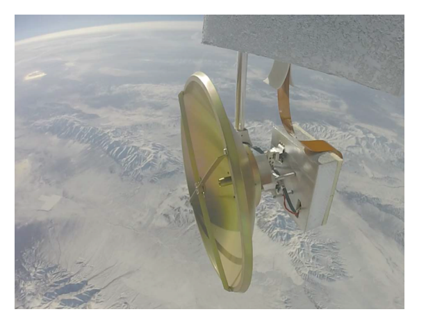
Fig. 4. Project Loon B2X Parabolic Reflector Antenna [6]

curacies. The discontinued Loon Project (balloon HAPS) which was the first commercially deployed multi-HAPS network implemented these links by using parabolic reflector antennas [6]. These antennas were mounted on a controllable gimbal capable of rotating in both the Azimuth and Elevation directions to point to another HAPS balloon or downwards to a ground station (see figure 4). This enabled the Loon HAPS platforms to implement both service and inter-platform/feeder links from the same antenna assembly. Project Loon engineers