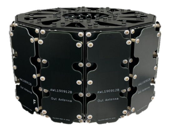
Fig. 3. Cylindrical multi-beam phased-array antenna by Softbank & HAPSMobile [5]

curacies. The discontinued Loon Project (balloon HAPS) which was the first commercially deployed multi-HAPS network implemented these links by using parabolic reflector antennas [6]. These antennas were mounted on a controllable gimbal capable of rotating in both the Azimuth and Elevation directions to point to another HAPS balloon or downwards to a ground station (see figure 4). This enabled the Loon HAPS platforms to implement both service and inter-platform/feeder links from the same antenna assembly. Project Loon engineers