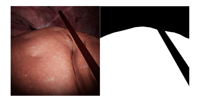
Fig. 2 Sample synthetic data and liver segmentation