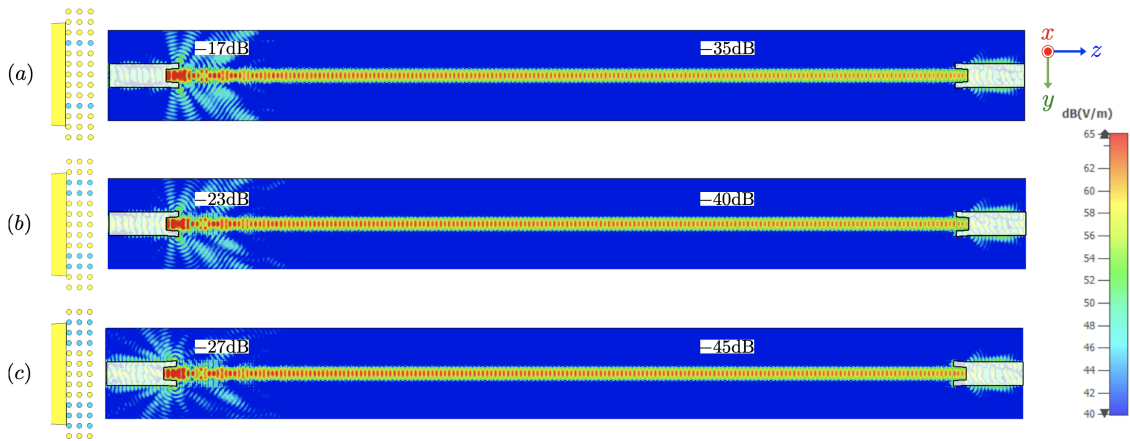
Fig. 2. The E-field distribution in dB over the surface with l_c = 12\text{mm} and f = 30\text{GHz} when shaping the path with (a) one layer, (b) two layers or (c) three layers of cavities filled with Galinstan.