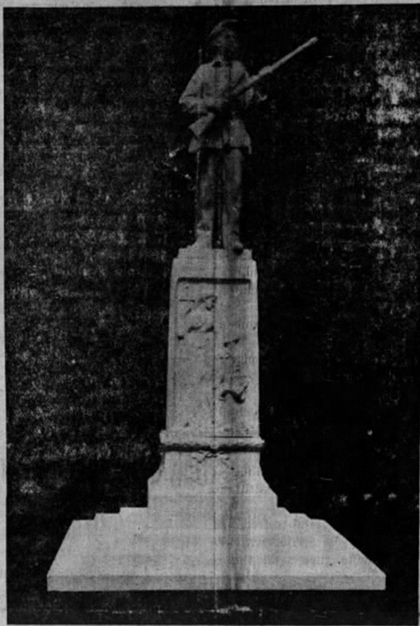
Figure 3. The Tar Heel , 1 April 1911.