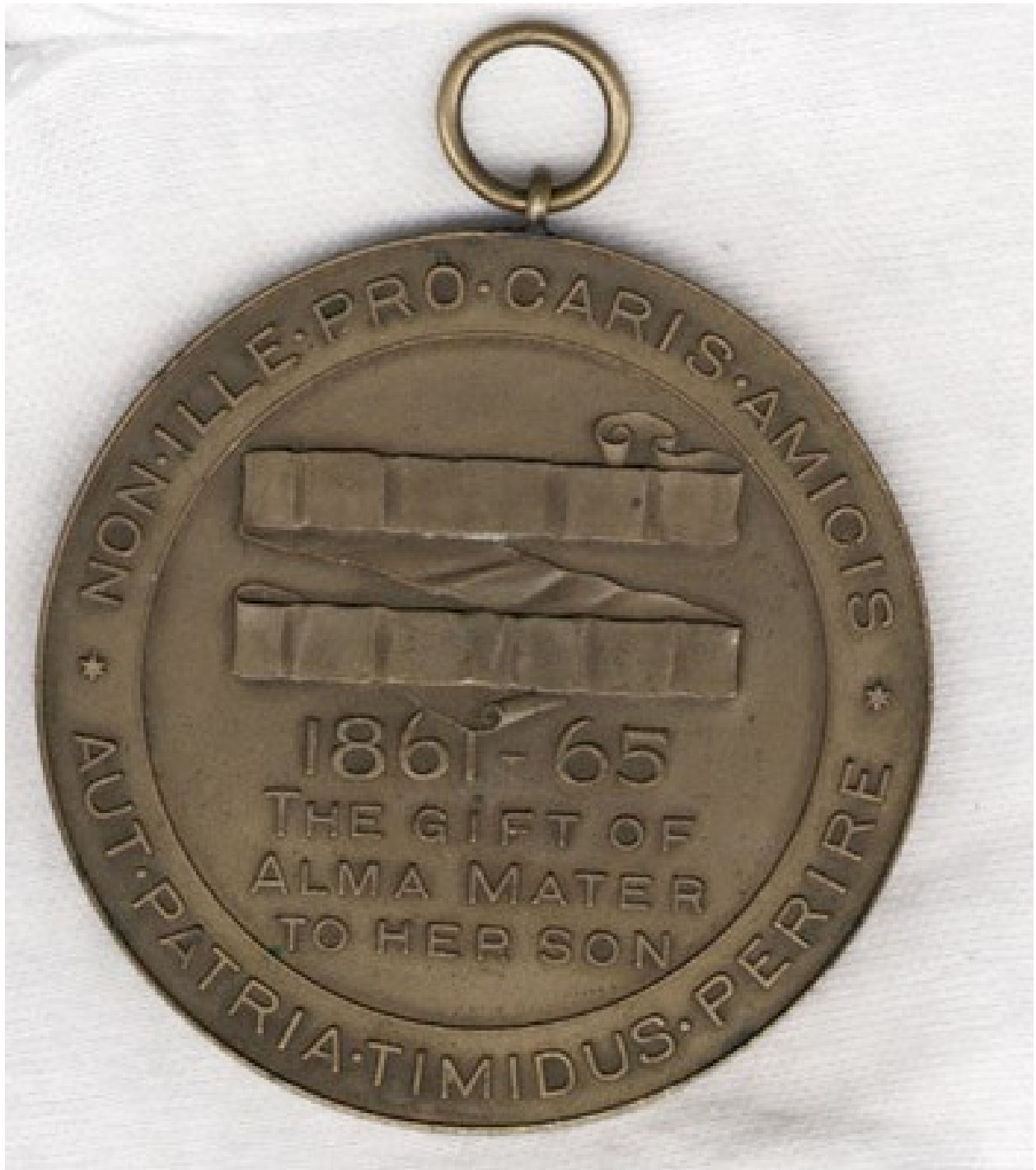
Figure 1. Bronze Medal, Reunion Letter, and Printed List, UVA Special Collections. The quotation is from Horace's Odes 4:9. One modern translation reads: "Not afraid to die for his dear friends or native land." Loeb Classical Library , 33: 246-247.