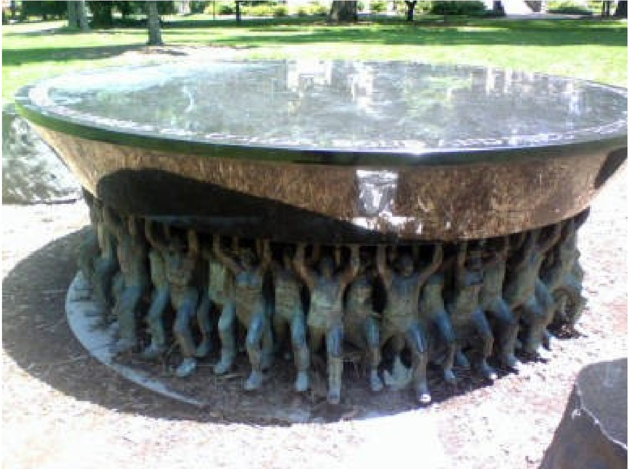
Figure 5. Unsung Founders monument.

In 2014, UVA's President's Commission on Slavery and the University recommended that the university partner with other institutions to document how they had exploited and profited from enslaved labor. Over the next six years, the resulting consortium -- Universities Studying Slavery (USS) -- has provided a network for scholarly discussion across more than four dozen institutions, including some in the United Kingdom, Ireland, and Canada. UVA has also begun construction on a Memorial to Enslaved Laborers, a monument that will made a substantial footprint on the campus landscape. Located near the Rotunda, the monument will be formed two concentric granite rings, the larger of which will bear the "the known and unknown names of the